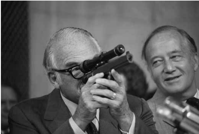
Senator Goldwater examines CIA dart gun as Senator Charles “Mac” Mathias (R-MD) looks on.