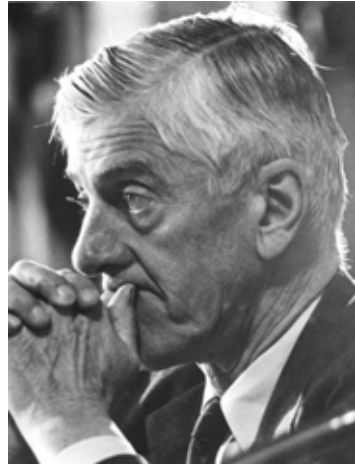
Senators Richard Russell (I) and Leverett Saltonstall. Between them, they chaired the powerful Armed Services Committee for 20 years, 1951–70.