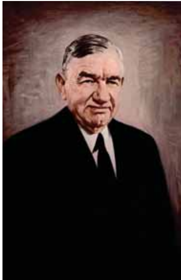
Representative Clarence Cannon, chairman of the House Appropriations Committee.