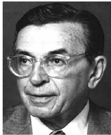
Senator Daniel Inouye (l), first chairman of the Senate Select Committee on Intelligence, and Representative Edward Boland, first chairman of the House Permanent Select Committee on Intelligence. Each was instrumental to the successful inauguration of his respective committee.