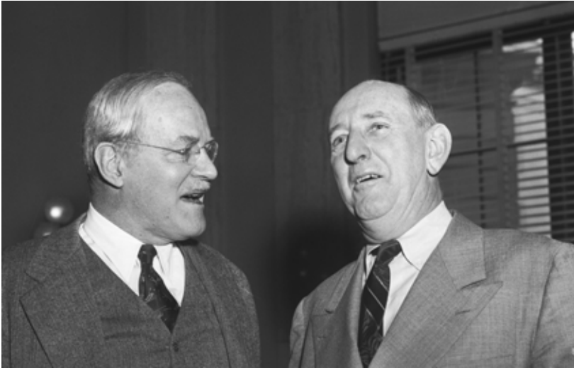
Allen Dulles (l) with Senator Richard Russell. The gregarious Dulles made a point of meeting personally and regularly with congressional leaders responsible for CIA oversight.