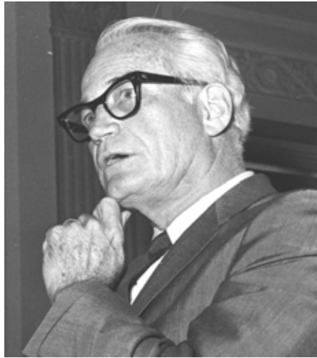
Senator Barry Goldwater. Although he opposed the establishment of the Senate Select Committee on Intelligence, he served as the committee's chairman between 1980 and 1984.

The HPSCI particularly benefited from the continuity in its leadership. Boland served as its chairman for eight years, his entire tenure on the committee. Most of the staff that he assembled at the beginning stayed with him, allowing the committee to overcome its initial deficit in staff expertise. There was also a high degree of staff continuity on the SSCI, although the leadership of the committee changed hands several times during Boland's tenure on the HPSCI. Senator Inouye left after two years, succeeded by Birch Bayh (D-IN), and when the Senate changed hands in 1980, Senator Goldwater took charge for the next four years. Perhaps at no time during the history of the oversight committees did personality and circumstance make such a difference.