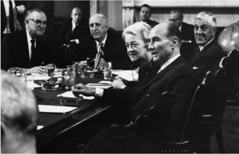
Meeting of the Senate Armed Services Committee, probably from the mid-1960s. From the left are Senators Stennis, Russel, Smith, Thurmond, and Saltonstall.

Stennis, Russell, Smith, and Saltonstall were members of SASC's CIA subcommittee. Stennis, Russell, and Saltonstall were also members of the Appropriations Committee, with the latter two also being members of the SAC's CIA subcommittee.