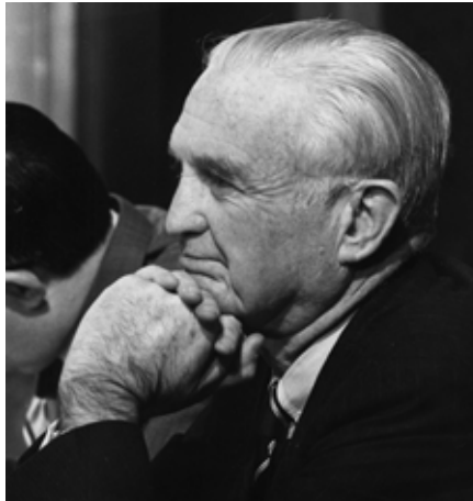
Senator Stuart Symington.

The dispute with Symington continued to simmer, until the publication of a new NIE in January 1960. The NIE, using a change in analytical methodology, revised even further downward the Soviet advantage in ballistic missile capabilities. Based on the new estimate, Secretary of Defense Thomas Gates made public statements minimizing the missile gap, while Dulles himself was crediting the Soviets with having greater capability in his closed session testimony. This disparity led Symington to charge the Eisenhower administration with “using intelligence information in such a manner that the American people have been given an inaccurate picture of what is necessary for our national defense.” 15 While Symington said he blamed the administration rather than Dulles for the impression the public was being given, Dulles himself acknowledged the change in analytical methodology used in the NIE had not been explained to Pentagon officials and was largely responsible for the confusion that ensued. 16