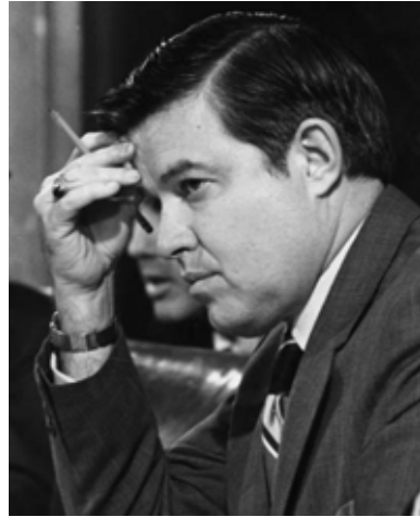
Senator Frank Church

From her perch on the House Government Operations Committee, Abzug had, in her inimitable take-no-prisoners style, raked Colby over the coals for having kept a file on her. Admitting that he had “gotten sore,” Colby recalled telling her that “if she were going to visit [terrorists] abroad, enemies of the United States, there was no way I was going to keep her name out of our records.” 112