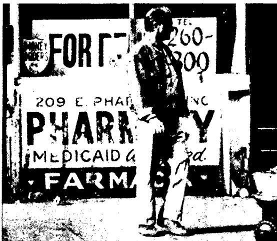
Undercover man: Senator Moss visits a New York City storefront clinic in disguise