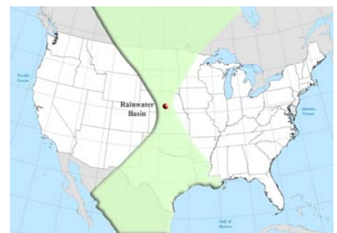
Figure 2. The Rainwater Basin is located at a focal point of Central Flyway spring waterfowl migration.