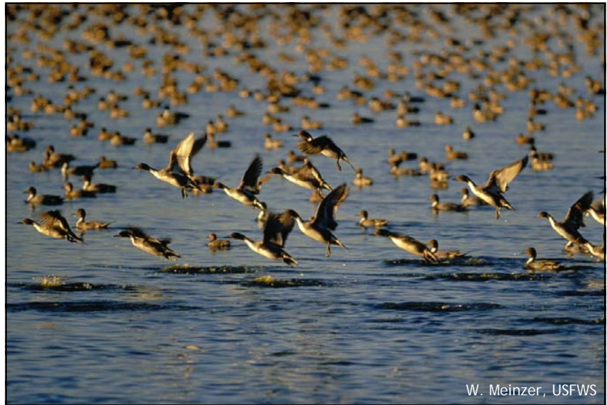
W. Meinzer, USFWS

Waterfowl foraging efficiency declines as resources are depleted. Studies suggest a threshold of 20 kg/acre of dry seed mass at which point waterfowl no longer forage efficiently (Reinecke et al. 1989). The amount of energy waterfowl can derive from 1 gram of seed is described as true metabolizable energy (TME). TME is represented as kcal of energy per gram of forage (kcal/g). This value is central to a bio-energetic model as it allows grams of seed per acre to be represented as energy (kcal) per acre. This conversion allows a bio-energetic model to relate available forage to waterfowl energetic requirements. For example, Kaminski et al. (2003) deter-