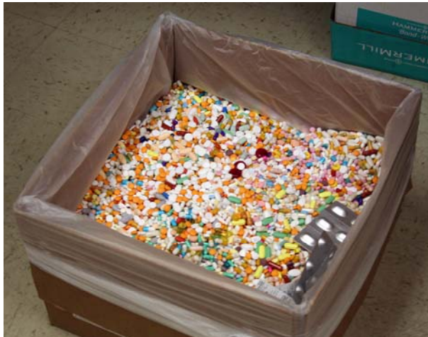
Unused Drugs at Nebraska Veterans Home, Grand Island, NE © 2007

Upon completion of the health services study, EPA hopes to understand what factors contribute to unused pharmaceutical disposal methods at health service facilities and which disposal methods represent best practices to minimize environmental impacts.