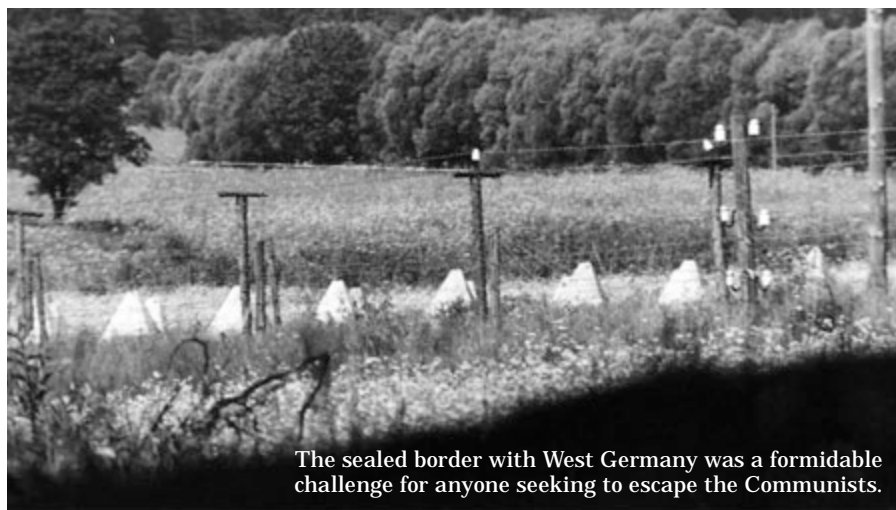
The sealed border with West Germany was a formidable challenge for anyone seeking to escape the Communists.

Given that the victims were moving at night through unfamiliar and dense woods, they tended to blame themselves for having lost their way and seldom realized that they had fallen for an StB provocation. Some firmly believed they had already been on German soil but were kidnapped by the border guards and taken back into Czechoslovakia.