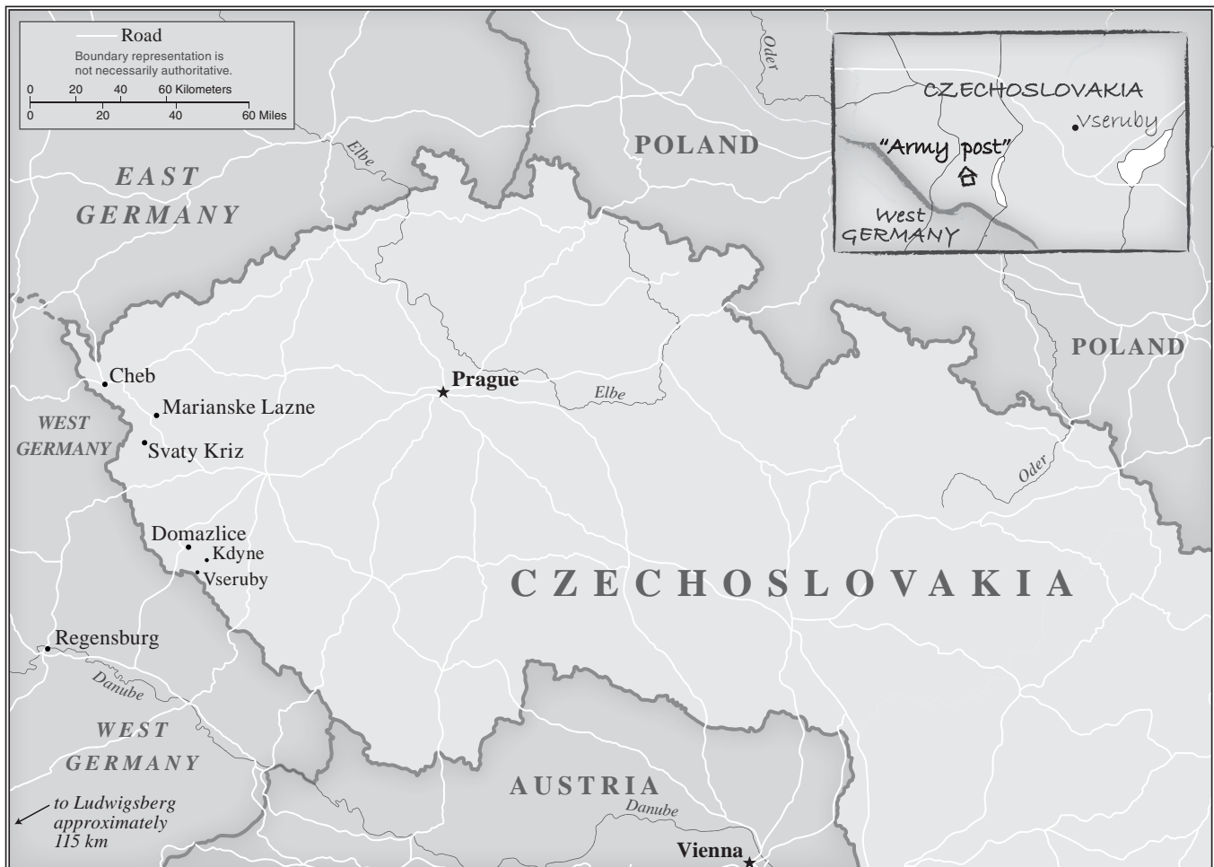
DI Cartography Center/MPG 793647AI (G03253) 3-11