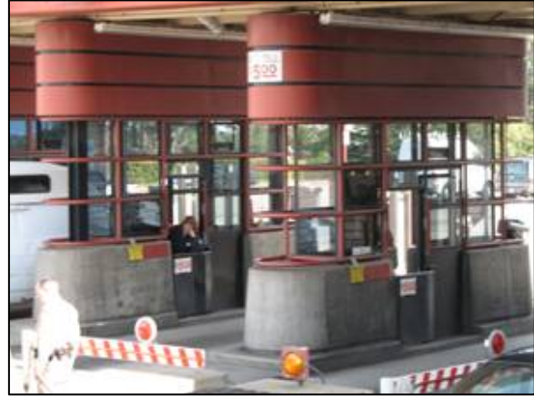
Figure 31. Gates in Use to Indicate that a Lane is Closed

All agencies use advance signing to warn drivers that they are approaching a toll plaza. Specific messages include “TOLL PLAZA AHEAD,” “PAY TOLL AHEAD,” etc. In addition to these warning signs, some agencies use lane designation signs in advance of the plaza. For example, one agency has a plaza where drivers can either take an Interstate or exit onto a local road immediately after passing through the plaza. After experiencing a number of vehicular accidents immediately downstream of