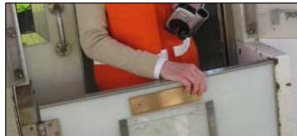
Figure 18. Bumped Out Dutch Doors Can Reduce Twisting and Turning for Collectors

Nearly all agencies that the team spoke with indicated that they have experienced injuries resulting from collectors' arms being pulled by customers as they pass through the plaza. To reduce these injuries, one agency has instructed collectors never to place their hands outside of the booth until after the vehicle has come to a complete stop. Another agency now instructs collectors to validate payment as the last step in processing a transaction (which in most cases keeps the gate down) to reduce the chance that the vehicle will attempt to pull away before the transaction is complete.