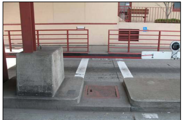
Figure 5. Painted Crosswalk for Workers