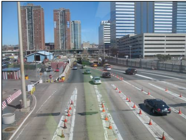
Figure 21. Pavement Markings and Cones Delay Merging Downstream at the Port Authority of NY & NJ's Holland Tunnel Plaza