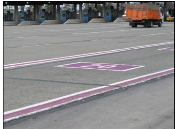
Figure 27. Pavement Markings Reinforce the Speed Limit in Dedicated ETC Lanes