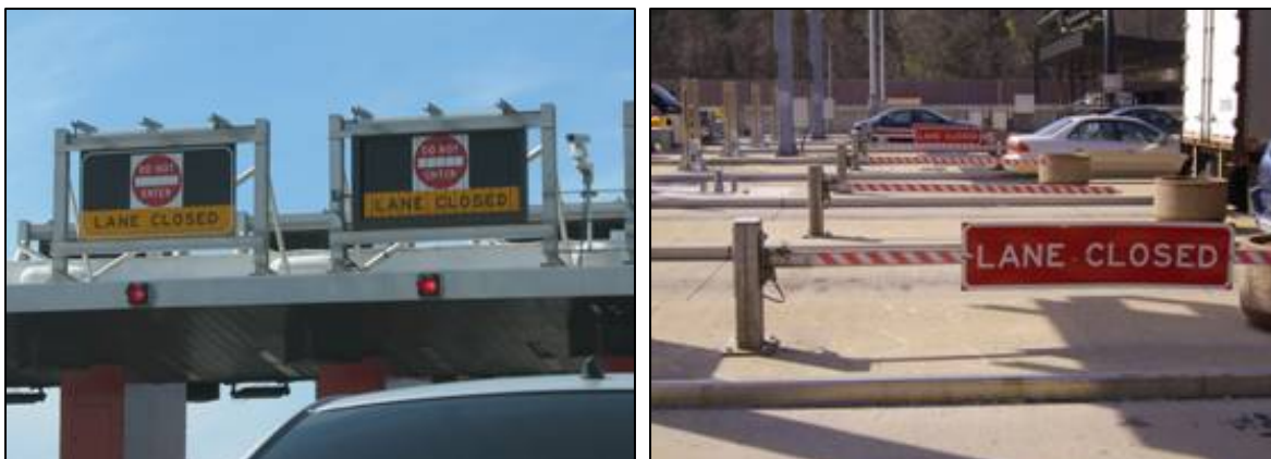
Figure 30. Options for Conveying a Closed Lane to Motorists

Agencies use a variety of methods for conveying a closed lane to motorists. Some agencies simply close a lane with a traffic cone or gate (some examples are shown in Figures 30 and 31). While this creates a physical barrier to help discourage drivers from entering closed lanes, it can be dangerous for collectors to put the gate into place. In addition to this, some agencies have faced problems with motorists not seeing closed gates. To address this, one agency has installed unique three-foot high orange reflectors on its gates (similar to driveway markers). Since the addition of the reflectors, the agency reported that there has been a significant reduction in the gates being hit. Beyond this, many agencies have signs on their gates to further communicate to motorists that the lane is closed, and to draw attention to the gates. In terms of messages, some use a “LANE CLOSED” sign or a “DO NOT ENTER” sign. One agency used to use a “STOP” sign on a gate, but moved away from this after noticing cars approaching the gate and waiting for it to open. Other agencies have moved away from