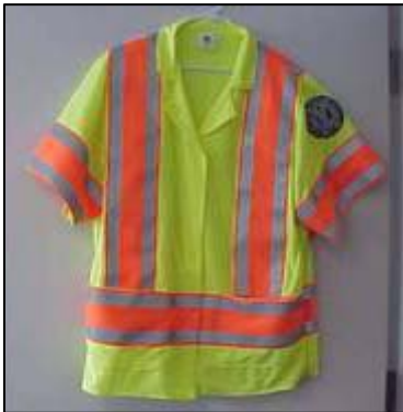
Figure 9. Safety Smock

Depending on the climate, some agencies issue collectors a retroreflective jacket (as shown in Figure 10). Another agency issues toll collectors a 3-in-1 coat. The coat is lined and fluorescent yellow-green. The sleeves can be unzipped and removed for spring and fall and the lining unzips so that it is more vest-like in the summer.