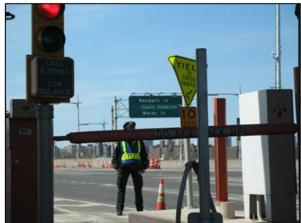
Figure 23. Enforcement Presence at an MTA Plaza