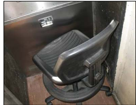
Figure 14. Chair with Circular Foot Rest