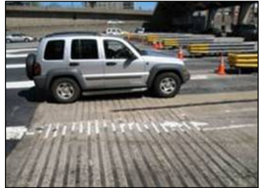
Figure 24. Rumble Strips

Some agencies have found it effective to use rumble strips or grooved pavement in the area just upstream of the plaza (typically in advance of the flare for the toll plaza) to draw motorists' attention to their speed and to provide toll collectors with an auditory warning that a vehicle is approaching (as shown in Figure 24).