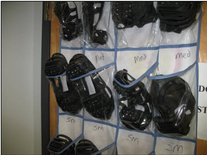
Figure 11. Crampons Can Help Collectors Avoid Slips in Snowy and Icy Conditions

Finally, as previously mentioned, several agencies focus on hands-free crossing with the use of shoulder bags to carry belongings (with the idea that having both hands free will make it easier for collectors to catch themselves if they fall). One agency now issues collectors cash bags instead of cash drawers to facilitate hands-free crossing (as shown in Figure 12).