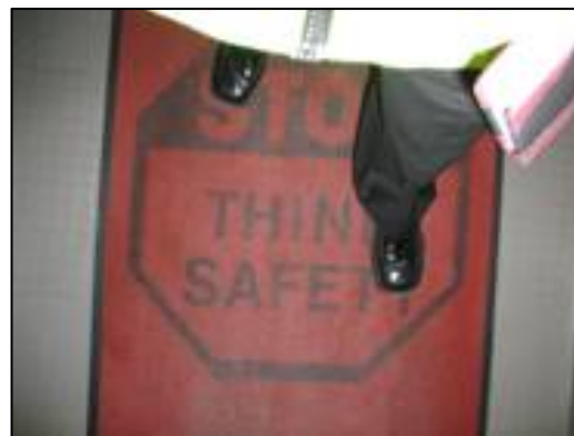
Figure 34. Floor Mat in Plaza Building Reminds Employees to “Think Safety”

Two agencies that the team visited made use of random safety audits, with one using internal staff to conduct the audits and one using an outside firm (since plaza personnel were able to identify the internal auditors). Both of these agencies also supplemented the formal audits with more frequent “self-inspections” by plaza managers and supervisors.