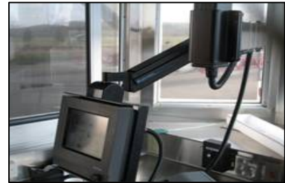
Figure 17. Denver E-470's Adjustable Height Terminal

Some agencies have implemented adjustable-height terminals, chairs, and/or cash drawers in an effort to reduce workplace injuries associated with reaching (an example of an adjustable-height terminal is shown in Figure 17). In many cases strains can be caused by leaning out of the booth to see oncoming or exiting traffic. Depending on the booth design, collectors sometimes noted that leaning was necessitated by advertisements or sunshades on the window making it difficult to see out, or simply by booth/plaza design (e.g., a pillar can sometimes block their view of oncoming traffic).