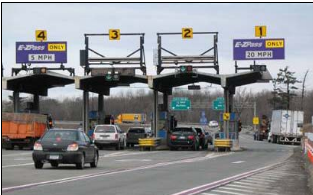
Figure 19. Dedicated ETC Lanes Positioned at Both Sides of a Plaza

Toll authorities across the country have tackled the challenge of lane changing in a variety of ways. Many agencies make it a standard practice to position their dedicated high-speed ETC lanes to the left side of their plazas (i.e., toward the center of the roadway), with the idea that the customer expects faster-moving traffic to primarily be to the left side of the roadway. This practice appears to be effective except in situations where there are on-ramps or off-ramps in close proximity to the plaza, in which case positioning the ETC lanes to the left side of the plaza can cause unnecessary weaving maneuvers. To reduce weaving in these situations, some agencies have taken to positioning dedicated-ETC lanes to both the left and right side of their plazas as shown in Figure 19.