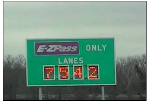
Figure 29. Dynamic Signs Display Current ETC Lane Numbers at a NYS Thruway Plaza

confusion typically center around providing improved traveler information. For example, an increasing number of agencies are employing the use of Variable Message Signs (VMS) upstream of the toll plazas that could be used to warn drivers of unexpected conditions such as incidents and maintenance activities. The New York State Thruway is experimenting with the use of digital signs upstream of the plaza indicating which lane numbers are currently accepting ETC and which are cash or mixed use (see Figure 29).