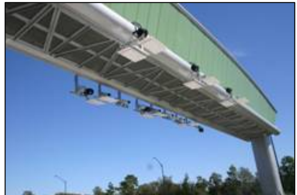
Figure 38. Florida Turnpike's Overhead Gantry for ORT Allows for Maintenance Activities without Road Closure