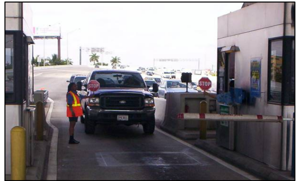
Figure 2. Handheld Stop Sign Aids Collector in Crossing Travel Lanes