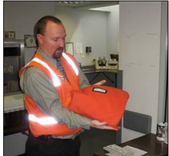
Figure 12. Cash Bags Can Facilitate Hands-Free Crossing

In an attempt to mitigate trips, some of the agencies visited use brightly colored striping on the edges of stairs and curbs (as shown in Figure 13) to improve visibility and depth perception. For those agencies with tunnels or overhead access to booths, many stressed the importance of having handrails on both sides of any stairways.