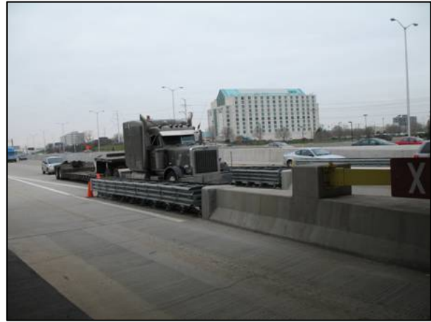
Figure 20. Concrete Barriers and Attenuators Physically Separate Traffic Upstream of an Illinois Tollway Plaza

Table 5 lists each strategy identified for mitigating safety issues associated with merging and lane-changing behavior and provides comments from practitioners on strategy effectiveness and any concerns/constraints. The table also provides information on practitioner ranking results from the Toll Facility Safety Study Workshop.