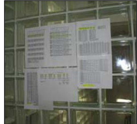
Figure 35. Tracking Employee Performance Publicly can Be an Incentive for Employees to Follow Safety Procedures

Safety incentive programs are also a fairly common technique for promoting a culture of safety. These types of programs reward employees for passing safety audits and maximizing days without injury either with cash bonuses or with points that employees can use to purchase items out of catalogs (examples of this are shown in Figures 36 and 37). In some cases, the program works such that an entire plaza is rewarded as a group, thus introducing the factor of peer pressure to maintain good safety records. While successful, these programs are not without controversy. One concern is that they must be constantly re-invented to remain fresh and capture the imagination and interest of the staff. Another concern is that they may actually lead to under-reporting or treatment of legitimate injuries and/or safety violations and can present challenges to management-worker relations. 13