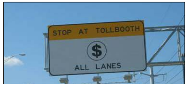
Figure 32. One Option for Conveying that Cash Is Accepted in All Lanes