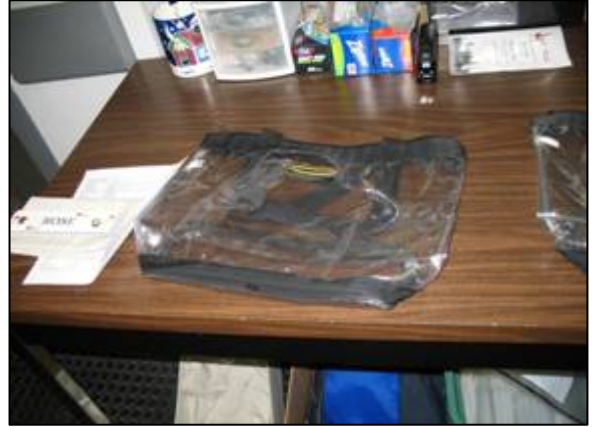
Figure 3. Clear Plastic Shoulder Bag for Collectors to Use when Crossing

There was also significant diversity in the methods used to demarcate the locations where collectors should cross. Most agencies use crosswalks painted on the pavement (as shown in Figure 5) and safety-shape barriers or railings (with openings at the crosswalks) to encourage workers to use the crosswalk. However, a small number of agencies are not as restrictive as to where collectors could cross – while they may still use painted crosswalks, they do not physically channel collectors to openings with gates, etc. for fear that these barriers could present dangerous obstructions if a collector was outside of the crosswalk area and needed to quickly get out of the travel lanes.