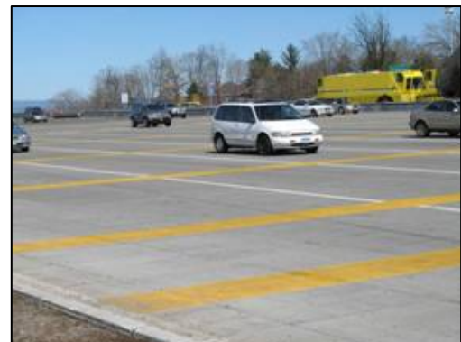
Figure 25. The Use of Transverse Pavement Markings to Reduce Speeding