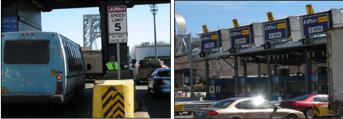
Figure 26. Speed Limits Are Posted at Each Lane To Reinforce Speed Limits