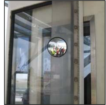
Figure 16. Convex Mirrors Can Reduce Twisting and Turning for Collectors