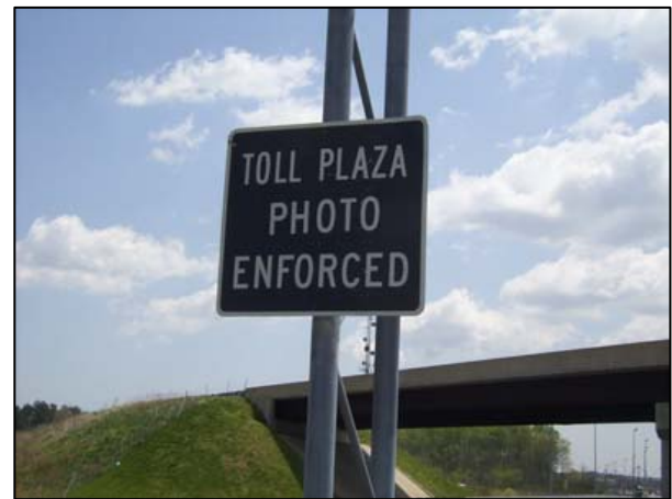
Figure 22. Sign Notifying Motorists that Plaza Is Photo Enforced

Increasing enforcement presence at plazas is another way that some agencies combat speeding (Figures 22 and 23 show examples of how different agencies demonstrate enforcement to motorists). In fact, some agencies feel that it is critical to all safety programs – so much so that one workshop participant even noted that no strategy would be effective without a strong enforcement program. Increasing enforcement presence is obviously an easier feat for those agencies that have a dedicated police force or well established relationships with the local police