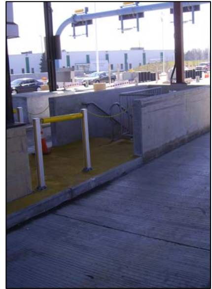
Figure 6. ManSaver™ Safety Bar

Related to crosswalks, many agencies have implemented some type of mitigation strategy to remind workers that they are crossing live lanes of traffic. At one end of the spectrum, some agencies make use of a device called a ManSaver™ Safety Bar. As shown in Figure 6, these are physical gates adopted from use on fire trucks that must be carefully opened to enter a travel lane (i.e., the worker must stop and pull the gate either upward or toward themselves), but that can be easily pushed through to get out of the travel lane on the other side. To ensure that collectors cross at the ManSaver™ bar, one agency that the study team visited has begun using chains at the sides of the crossing area in effect to channelize workers to a specific crossing area.