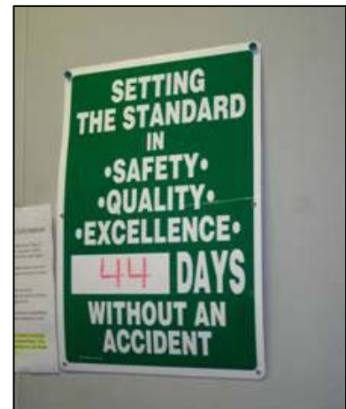
Figure 36. Sign in Plaza Office Reminds Employees about Safety Record