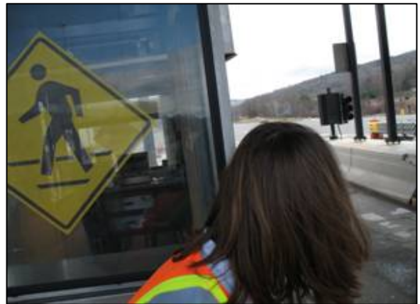
Figure 4. Booths can Create a Visual Obstacle when Crossing