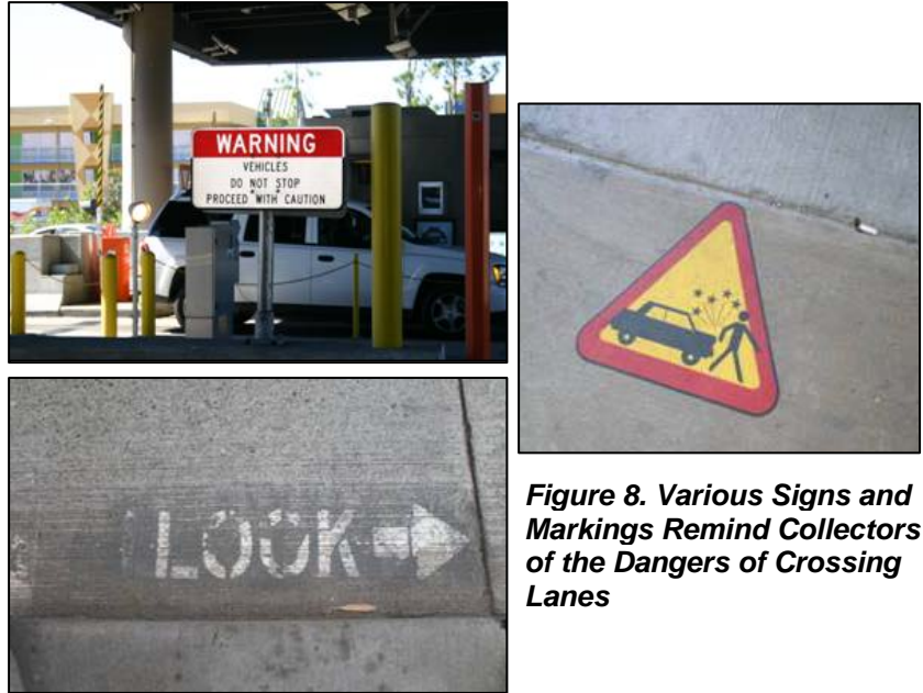
Figure 8. Various Signs and Markings Remind Collectors of the Dangers of Crossing Lanes

In terms of variations on the standard vest, one agency has recently adopted a safety smock which is light-weight, has short arms, and is waist length. It is fluorescent yellow green with orange sections and retro-reflective strips (similar to that shown in Figure 9).