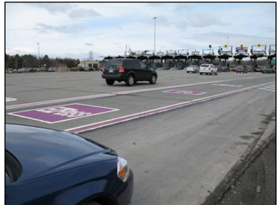
Figure 28. The Use of Pavement Markings To Identify Dedicated-ETC Lanes

Agencies have implemented a number of strategies that aim to direct non-ETC drivers away from ETC lanes in the first place. These include: implementing public education campaigns to familiarize drivers with the concept of ETC; adding signs – for example supplementing “brand” signs such as SunPass with generic signs such as “Pre-Paid Only”; and using specialized lane markings, such as differentiating high-speed ETC lanes with purple paint on the outside edges of the lane (as shown in Figure 28).