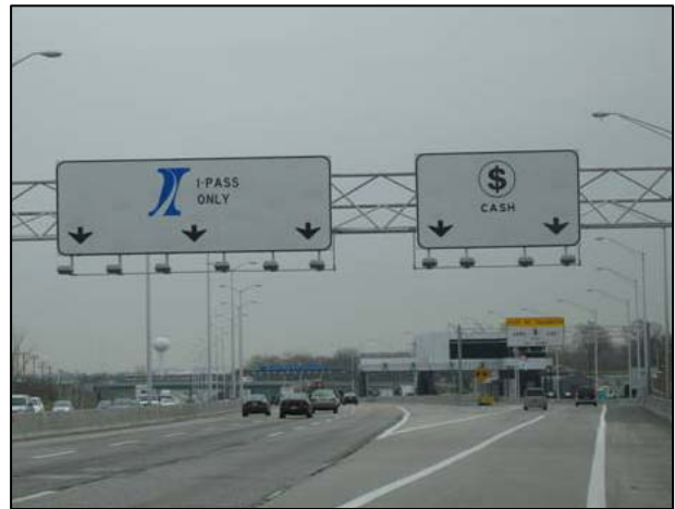
Figure 37. Open-Road Tolling in Illinois

One potential safety-related drawback to ORT (both fully “open road” and hybrid-ORT) is equipment maintenance since, in most cases, repairs that take place over the roadway would require that all lanes be closed. However, the Florida Turnpike has addressed this concern with a unique overhead gantry design that allows maintenance workers access to equipment without closing lanes or disturbing traffic (Figure 38). The gantry provides an area large enough for maintenance employees to work above the roadway, and all ETC equipment is positioned on a lever that allows workers to pull the equipment up into the work area. Additionally, there is a screen shielding workers from passing motorists to avoid distraction, and there is a fine mesh material at the base of the gantry below the work area to prevent the danger of debris dropping onto the traffic below during maintenance activities.