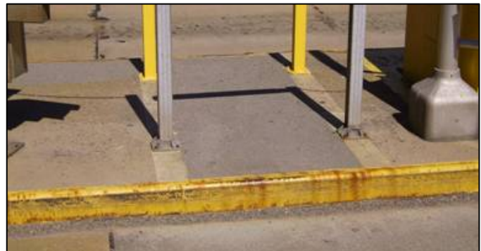
Figure 13. Brightly Colored Curbing in the Crossing Area Can Reduce Trips

Table 2 lists the strategies for mitigating safety issues associated with the worker environment, with information on effectiveness, concerns, constraints, and ranking.