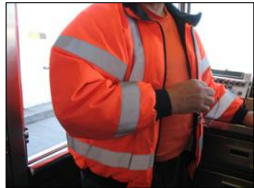
Figure 10. Retroreflective Jacket

visibility safety vest with five-point breakaway. The vests were ordered in response to news reports that vests would get caught on passing vehicles and workers were being dragged several hundred feet. The vests are fluorescent yellow green, and are supplied to each employee and