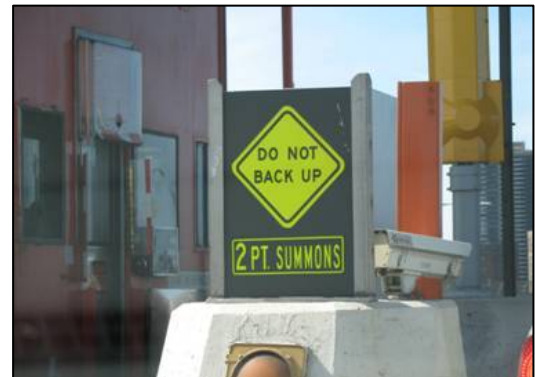
Figure 33. “DO NOT BACK UP” Sign to Reduce Unsafe Motorist Behavior