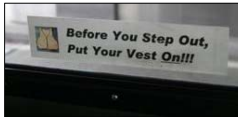
Figure 7. Signs and Stickers in Plaza Building and Toll Booth Remind Workers about Safety

Two agencies visited use signs at toll lane crossings to mark ETC lanes so that employees can easily identify lanes where traffic does not stop. One agency uses signs that read “E-Z LOOK,” with eyes drawn into “LOOK” and an arrow pointing in the direction of oncoming traffic. The signs are metal and mounted on the side of the bullnose facing in toward the lane at crossing locations. The same agency also uses red on