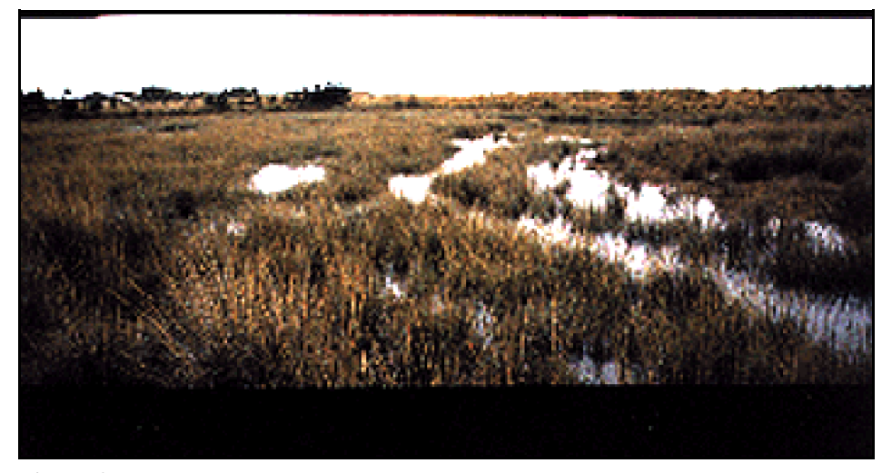
Figure 2. Tidal wetlands, Bracut Marsh Mitigation Bank, September 1996

Benefits: The Bracut Marsh mitigation bank was used to mitigate for impacts to small