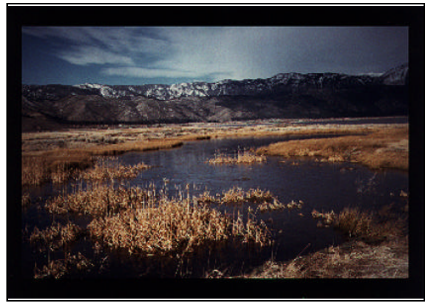
Figure 3. Shallow water and emergent wetland, Washoe Wetland Mitigation Bank, November 1996. Looking at west from easternmost edge of bank.

Future Action: Currently, the mitigation bank is functioning