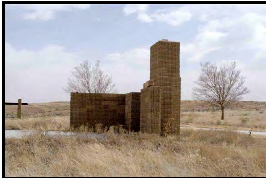
Failing fire pit facility at location of group shelter