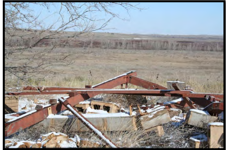
Some shelters were completely collapsed with scattered debris