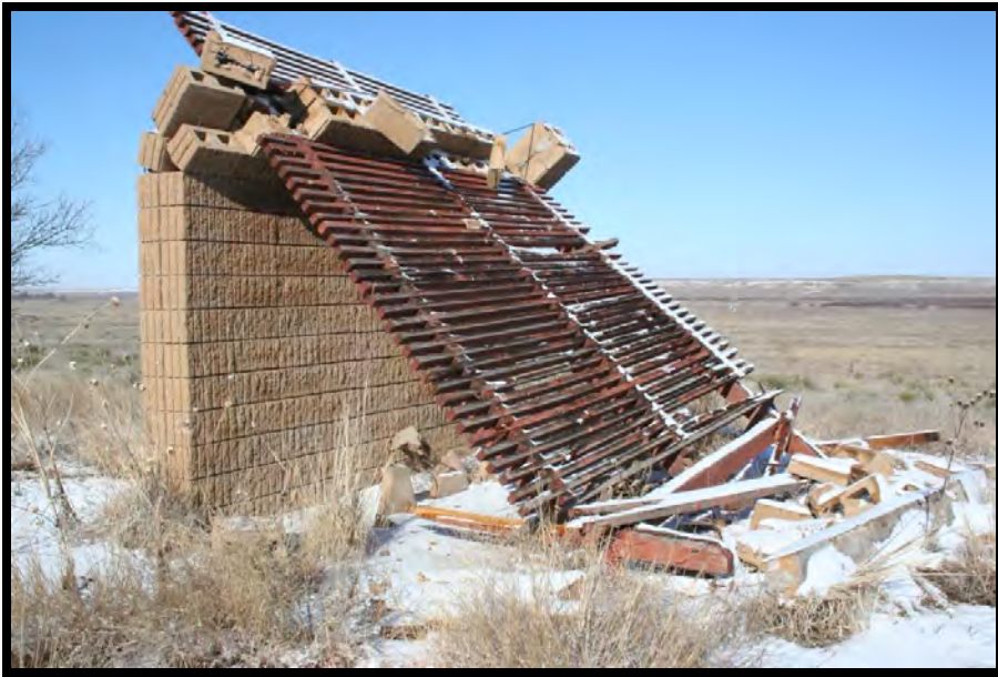
Table shelter damaged by fire and vandalism