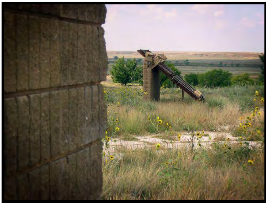
Canopy falling down