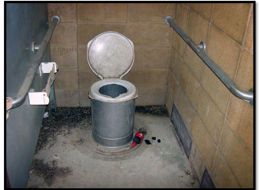
Dilapidated toilet buildings in various states of failure