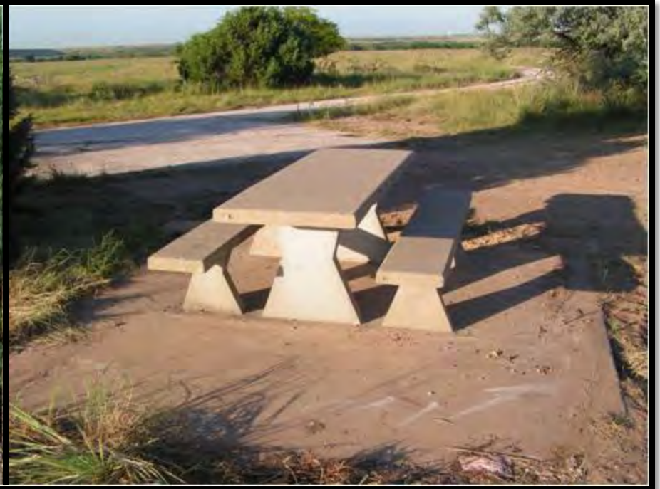
Failing dangerous overhead canopy and wall of table shelter removed with the table left in place for public use