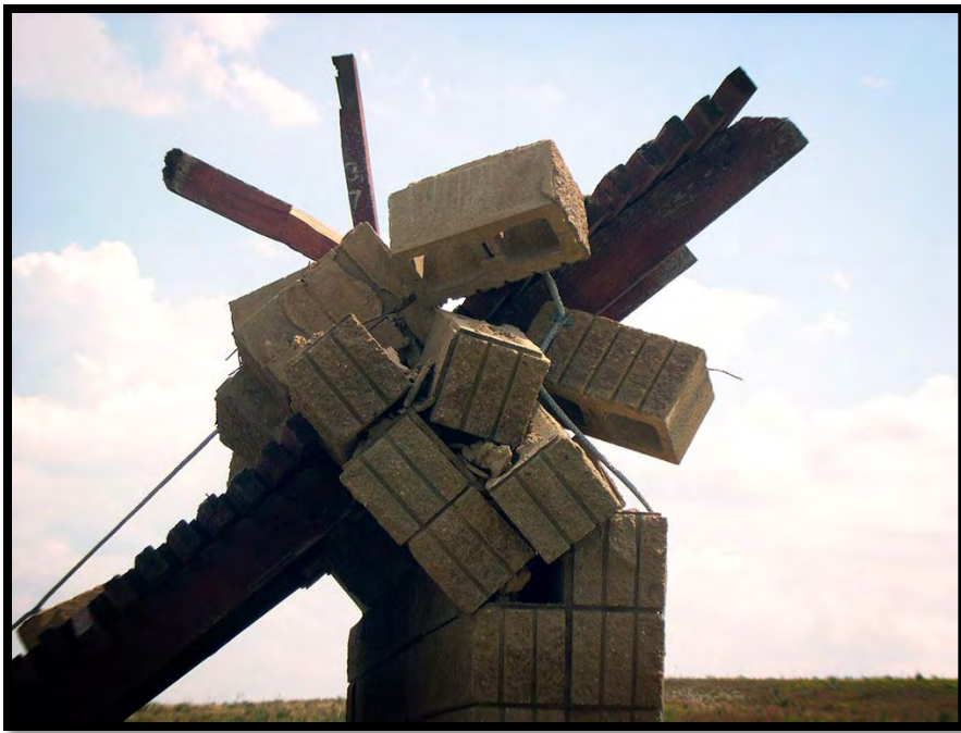
Collapsed table shelter with dangerous hanging masonry