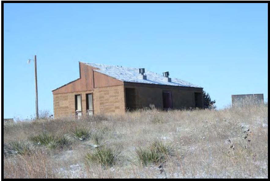
Toilet building in disrepair with the roof structure collapsing