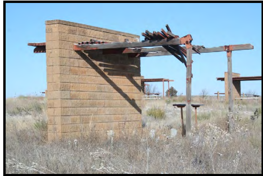
Numerous table shelters in various stages of failure