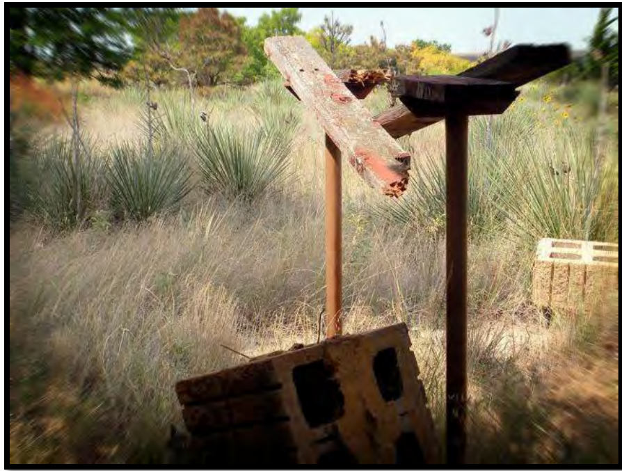
Busted utility table