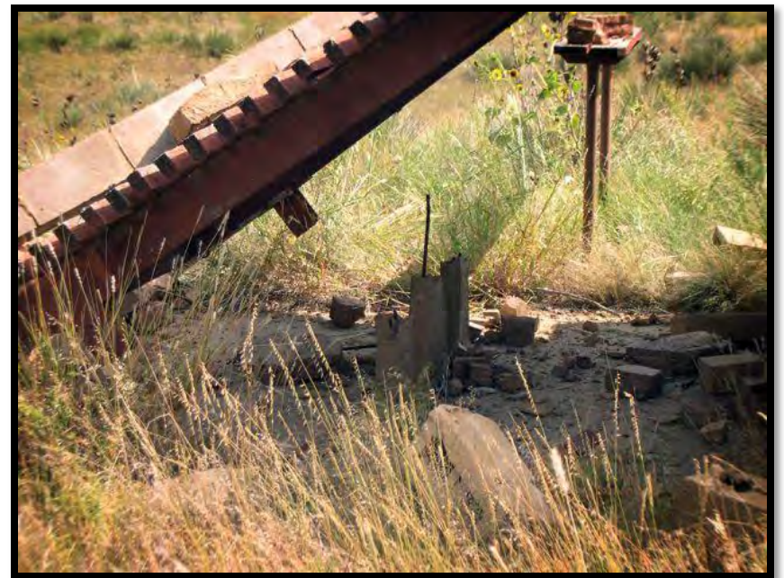
Closeup of campsite pad