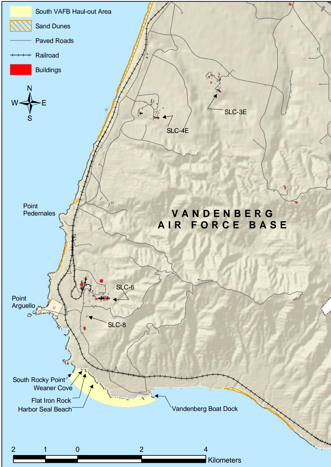
Figure 1. Map of the south VAFB harbor seal haul-out sites, and south VAFB Space Launch Complexes (SLCs).