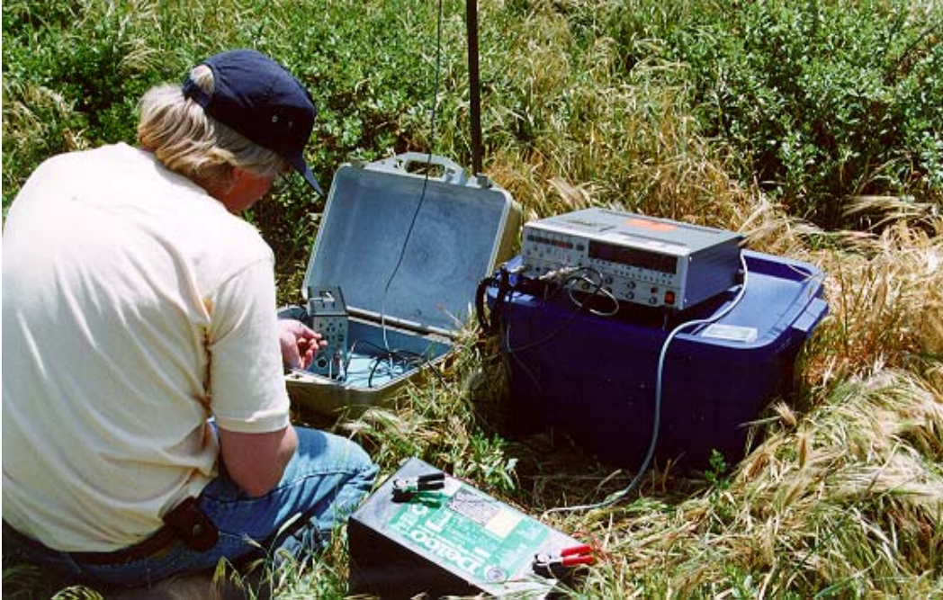
Figure 4. DAT system used to record the launch noise and sonic booms.

for just over 3 hours, providing ample time to record launch noise or sonic booms. The digital data was directly downloaded from the DAT recorder to a computer using TEAC QuikVu software and hardware. The waveforms were then analyzed using custom routines programmed in MatLab, a technical computing language.