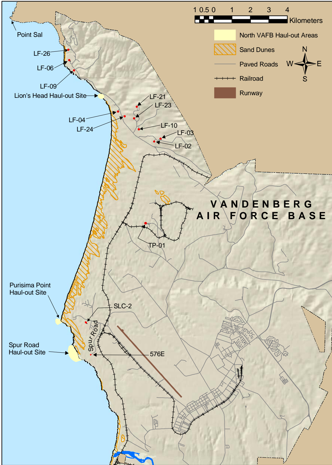
Figure 2. Map of the north VAFB harbor seal haul-out sites, and the north VAFB launch sites and facilities.