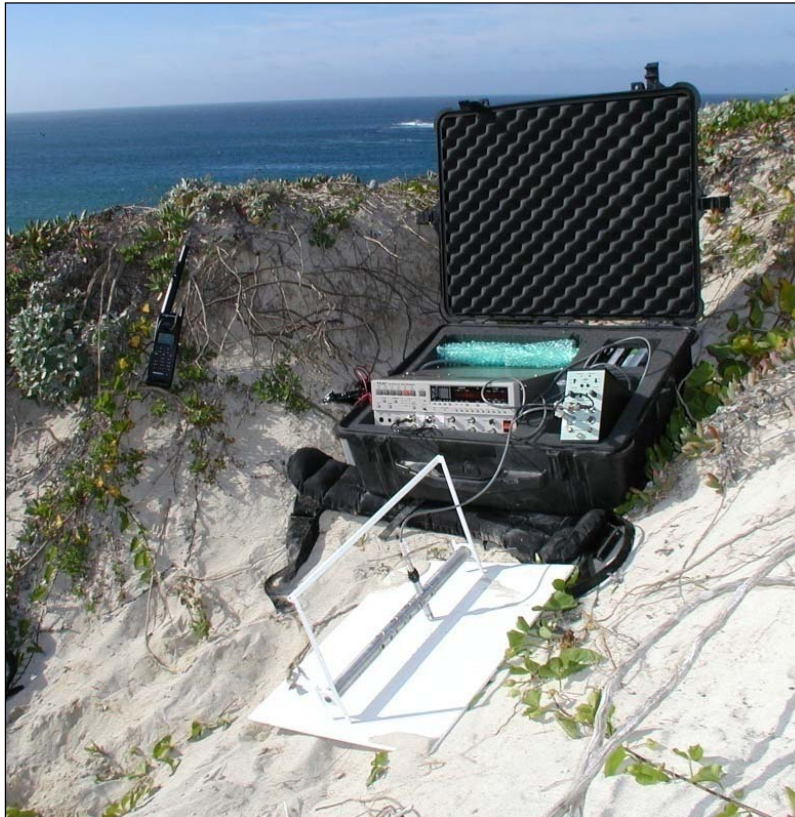
Figure 5. The DAT system used to record sonic booms from launch vehicles passing over near SMI.

A TEAC DAT recorder was placed near the biological monitoring site on SMI (Figure 6) and set up to record the potential sonic boom. The microphone was mounted inverted (grid cap facing down), five millimeters above a custom- made heavy steel plate. This mounting configuration has been shown to accurately collect sonic boom waveforms (Lee 1988). For protection from the wind, several layers of thin nylon material enclosed the steel plate holding the microphone. Prior to the collection of data, the DAT recorder was calibrated with a Bruel & Kjaer sound level calibrator type 4230 (94 dB calibration tone at 1000 Hz). During the launch event, the acoustic monitoring personnel watched the equipment display to determine if the equipment registered a sonic boom impact.