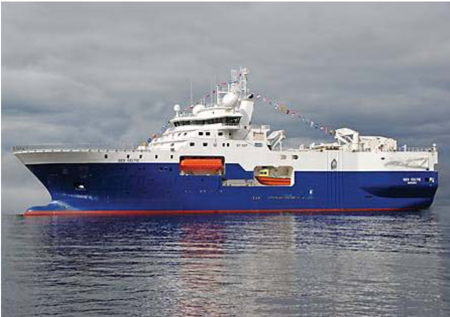
Figure 1. The seismic vessel M/V Geo Celtic .

One seismic source vessel will be employed to tow the two 3,000 in 3 airgun arrays and hydrophone streamer for the 3D (and 2D) seismic data acquisition and to serve as a platform for marine mammal monitoring. This seismic vessel is the M/V Geo Celtic or similar equipped vessel. According to the Bergen Group website ( http://bergengroup.no/publish_files/Bergen_Group_Proforma_3Q.pdf ), this vessel is the world's largest seismic vessel. It is an ice-class vessel (ICE-C). It is 100.80 m long, with maximum breadth of 28 m, and it cruises at 16 knots. Marine mammal monitoring will occur from this vessel.