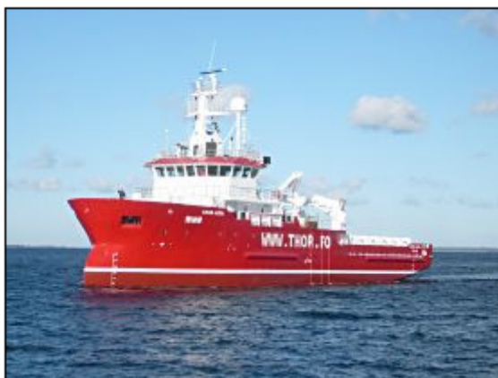
Figure 2. The M/V Gulf Provider and the M/V Thor Alpha .

The M/V Thor Alpha will be used to conduct marine mammal monitoring, support and supply duties. This ship is 55.10 m long and its “breath moulded” is 12.50 m.