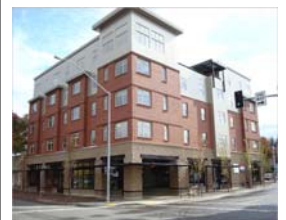
Springfield, Oregon's newest affordable housing complex, a mixed-use new construction building.

America's Affordable Communities Initiative has been invited to address a plenary session at the International Federation for Housing and Planning to be held in Puerto Rico, in October 2008. More information will follow in the coming months.