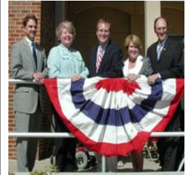
Johnson City Board of Commissioners

http://www.ci.springfield.or.us/dsd/Planning/IMAGES/EfficiencyMeasures_Final%20Combined_1_7_08.pdf