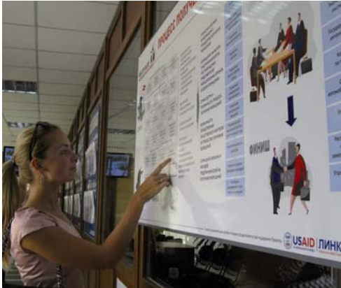
A visitor browses through the one-stop shop materials