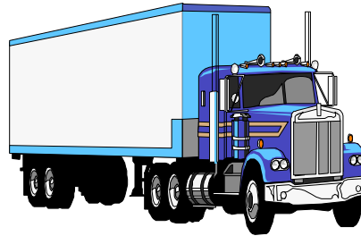
Safer highways through safer trucking

The state just needs to check MCMIS to see when the last MCS-150 update occurred. If the date is within the 12-month period prior to the first day of the new registration period, then neither a new MCS-150 nor updates to the preprinted information on the renewal is