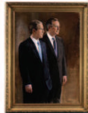
opposite: From the exhibit "Jacqueline Kennedy: The White House Years," the First Lady is pictured wearing the exhibited gown above: Portrait of Presidents George H. W. Bush and George W. Bush from the exhibit "Fathers and Sons: Two Families, Four Presidents" background: Evening bag, gift to First Lady Betty Ford, Ford Museum

Beyond exhibits and formal programs, the Libraries host special events to commemorate uniquely American holidays, such as President's Day and the Fourth of July. Storytellers and actors portraying our Presidents make it possible to hear George Washington discuss the nation's earliest days or Abraham Lincoln contemplate the Civil War. Many Libraries celebrate the holiday season with elaborate decorations originally used at the White House. And each Library observes its President's birthday with a special celebration.