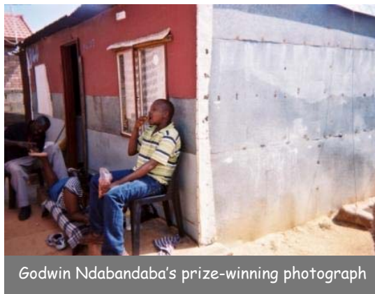
Godwin Ndabandaba's prize-winning photograph

On April 23 , a panel of judges convened at Mae Jemison to award prizes to top student photographers. The photos were taken during the "Photographing Your Environment" program, a three week course designed