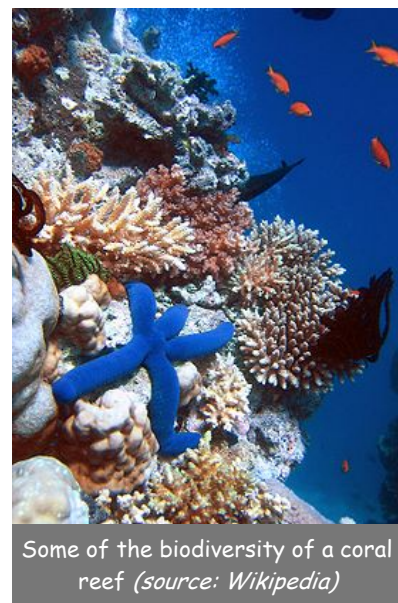
Some of the biodiversity of a coral reef

See also: http://en.wikipedia.org/wiki/Biodiversity