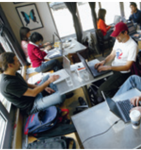
Above: A café in San Francisco, California, offers free wireless Internet access.

Daily metropolitan newspapers and evening network news broadcasts once dominated news delivery, but cable news has now seized a significant share of the news-consuming audience. Perhaps one reason is that some cable channels now provide news and commentary with a decided point of view that appeals to certain segments of the audience. A survey conducted by the Pew Research Center for the People and the Press revealed that 74 percent of viewers find the three major network news programs to be “pretty much the same,” while 48 percent found “real differences” in coverage among three cable news outlets.