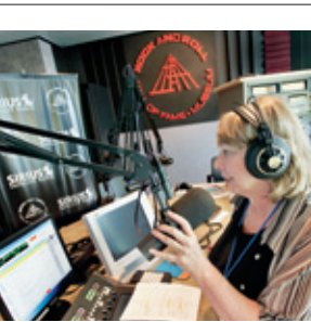
Top: Bloggers report from the 2008 Democratic National Convention in Denver, Colorado. Above: A live satellite radio broadcast from the Rock and Roll Hall of Fame in Cleveland, Ohio.