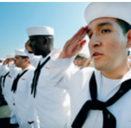
Foreign-born sailors salute during a naturalization ceremony aboard the USS Ronald Reagan , docked at Coronado, California, in 2006.

Both citizens and permanent alien residents are eligible to serve in the U.S. military. In peacetime, noncitizens who serve in the military may obtain citizenship in three years, as opposed to the five-year wait required of civilian applicants. During times of military hostilities, however, the president of the United States may allow noncitizens immediate naturalization. In July 2002, President George W. Bush issued an executive order granting expedited citizenship to immigrant men and women who served in the U.S. military since September 11, 2001. Previous administrations took similar actions, granting citizenship to 143,000 military participants in World Wars I and II, 31,000 who fought in the Korean War, and more than 100,000 veterans of the Vietnam and Persian Gulf Wars.