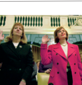
Top: In Massachusetts, the speaker of the state house delivers his annual address to citizens. Above: Two state senators take the oath of office as a new session begins.

Whatever the size of a state legislature or the salary of its members, the importance of their work cannot be underestimated. Addressing a group of state legislators meeting in Washington in 2009, Speaker of the U.S. House of Representatives Nancy Pelosi said, "States are the laboratories for so many ideas. Some of the things that we [in Congress] have confidence to run with are things that have worked at the state level."