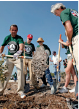
Volunteers from AmeriCorps and community partners plant one of a thousand donated trees to green the city of Miami, Florida.

“And if you do, I promise you your life will be richer, our country will be stronger, and someday, years from now, you may remember it as the moment when your own story and the American story converged, when they came together, and we met the challenges of our new century.”