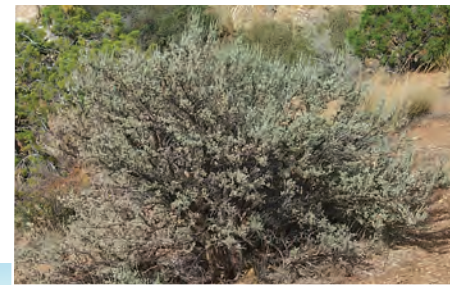
Sage-grouse rely heavily on mountain and Wyoming big sagebrush for food and cover.

Other sources of information on sage-grouse include the U.S. Fish and Wildlife Service, the U.S. Bureau of Land Management, and state fish and game departments.