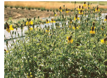
Stillwater germplasm prairie coneflower.