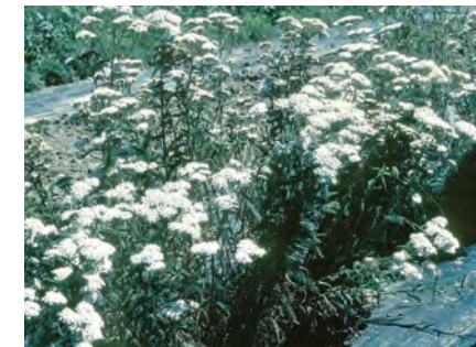
Great Northern germplasm western yarrow.