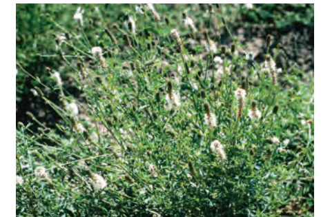
Antelope germplasm slender white prairie clover.