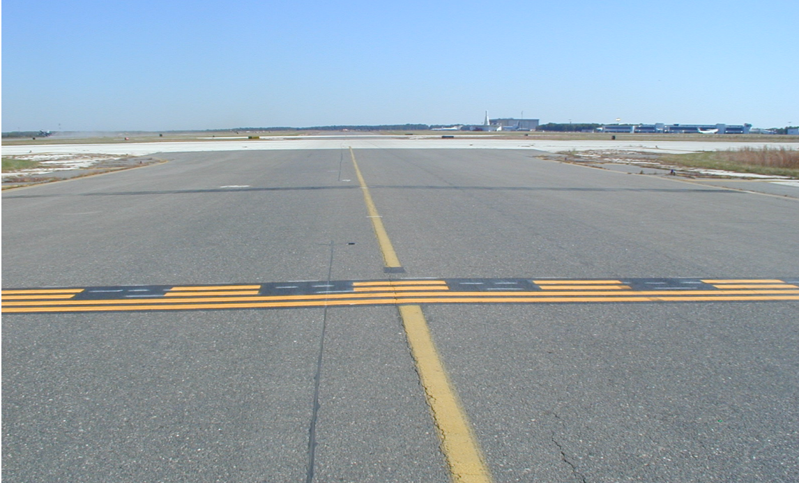
FIGURE 1. RUNWAY HOLDING POSITION MARKINGS OPTION #1