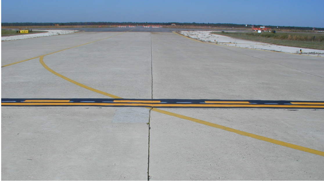
FIGURE 7. NONMOVEMENT AREA BOUNDARY MARKING OPTION #1