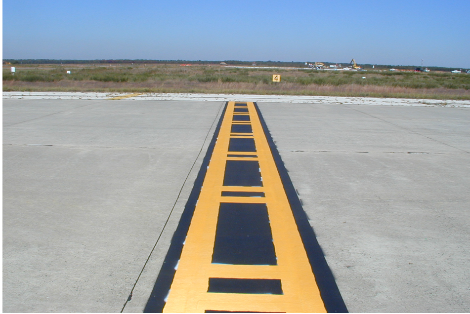
FIGURE 4. ILS/MLS HOLDING POSITION MARKINGS OPTION #1