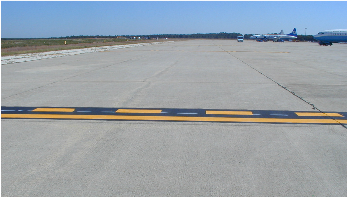
FIGURE 8. NONMOVEMENT AREA BOUNDARY MARKING OPTION #2