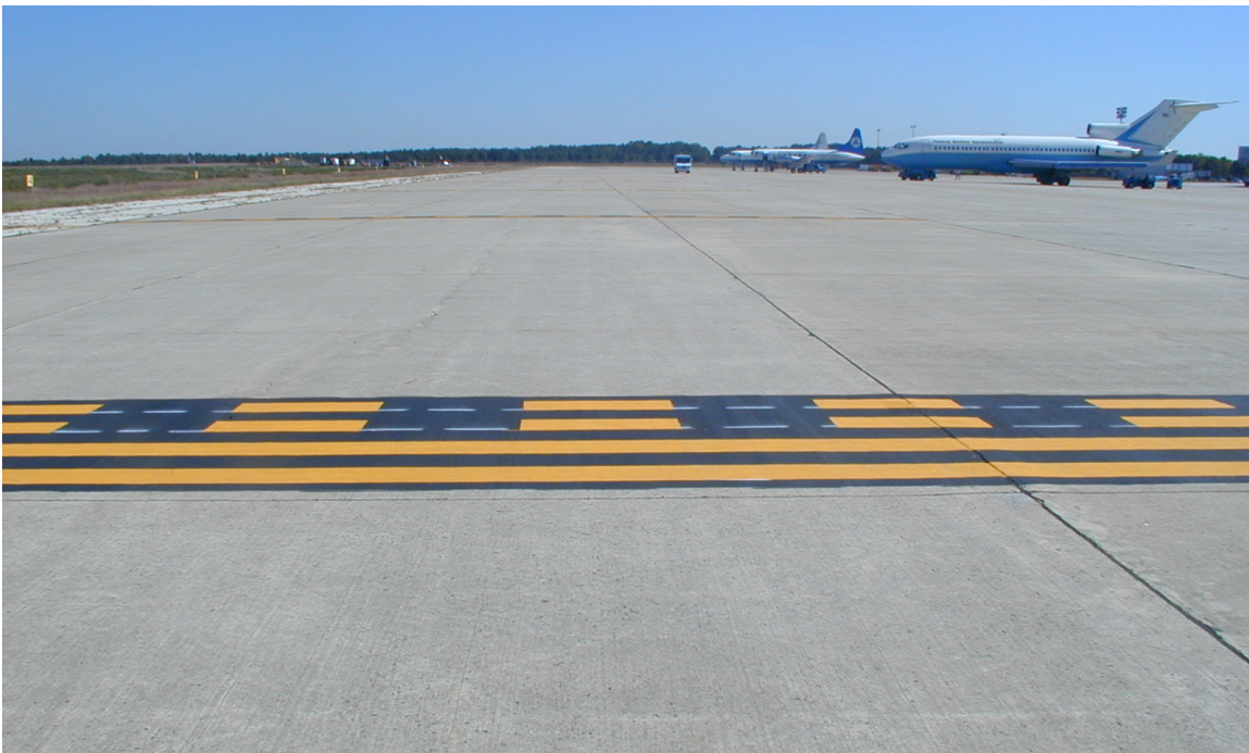
FIGURE 2. RUNWAY HOLDING POSITION MARKINGS OPTION #2