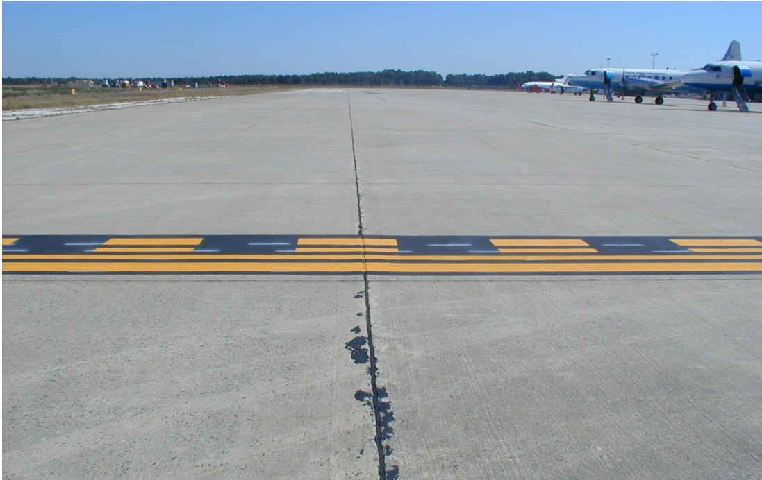
FIGURE 3. RUNWAY HOLDING POSITION MARKINGS OPTION #3

ILS/MLS HOLDING POSITION MARKINGS. The ILS/MLS holding position markings identify the location on a taxiway or holding bay where an aircraft is to stop when it does not have clearance to enter ILS/MLS critical areas. The critical area is the area needed to protect the navigational aid signal. The markings are installed perpendicular to the taxiway centerline but may be canted from the perpendicular in unique situations. ILS/MLS holding position markings on taxiways are yellow and will be outlined in black on light-colored pavements as presently stated in the Advisory Circular.