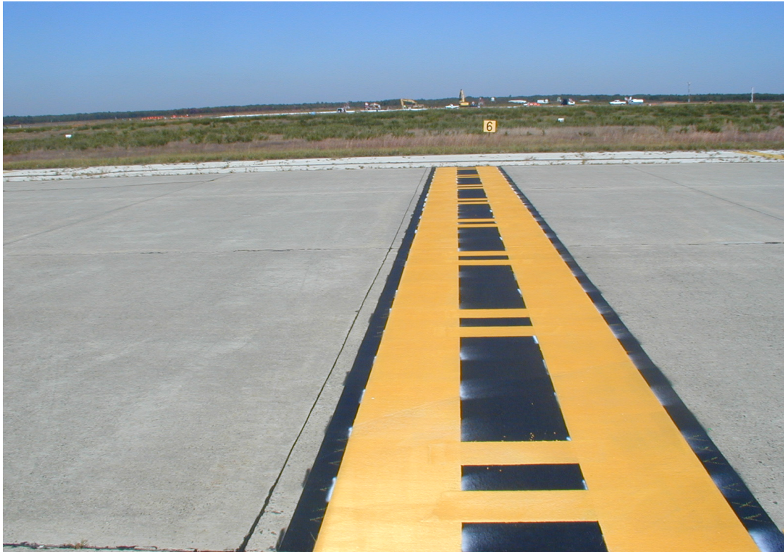
FIGURE 6. ILS/MLS CRITICAL AREA HOLDING POSITION MARKING OPTION #3

NONMOVEMENT AREA BOUNDARY MARKINGS. Nonmovement area boundary markings are used to delineate the movement area, i.e., area under air traffic control from the nonmovement area, i.e., area not under air traffic control. A nonmovement area boundary marking is located on the boundary between the movement and nonmovement area. In order to provide adequate clearance for the wings of taxiing aircraft, this marking should never coincide with the edge of a taxiway. A nonmovement area boundary marking is yellow and will be outlined in black on light-colored pavements as presently stated in the Advisory Circular.