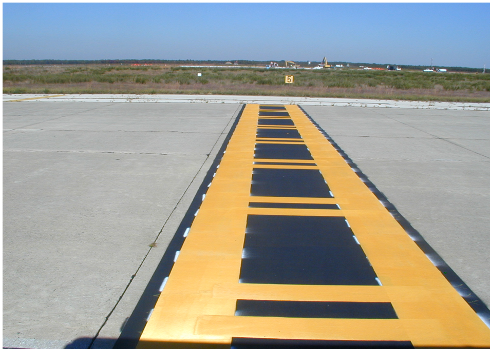
FIGURE 5. ILS/MLS HOLDING POSITION MARKINGS OPTION #2