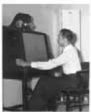
Fotoduplicador. BBF Reforma 34 (1942)

"La Biblioteca Benjamín Franklin inició sus servicios en abril de 1942"