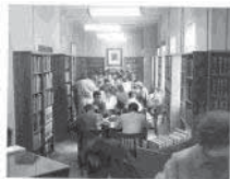
Aspecto de la sala de lectura BBF Reforma 34 (1942)

"La Biblioteca Benjamín Franklin inició sus servicios en abril de 1942"