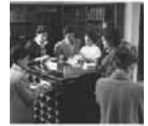
Antiguo catálogo de tarjetas BBF (1942)

"La Biblioteca Benjamín Franklin inició sus servicios con un acervo de 4,000 libros"