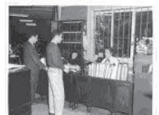
Servicio de Consulta BBF (1942)

"La Biblioteca Benjamín Franklin inició sus servicios con un acervo de 4,000 libros"