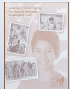
American Children in Brief

http://aspe.hhs.gov/hsp/09/NSAP/chartbook/index.pdf