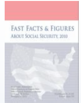
Fast Facts and Figures about Social Security

Liverpool 31, Col. Juárez, 06600, México, D.F. | Tels.: 5080-2089 / 5080-2733 Tel.(01)(55)5080-2089/(01)(55)5080-2733 Fax (01)(55)5591-0075 www.usembassy-mexico.gov/bbf/biblioteca.htm