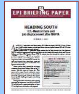
Heading South U.S.-Mexico trade and job displacement after NAFTA

http://www.iie.com/publications/wp/wp11-10.pdf