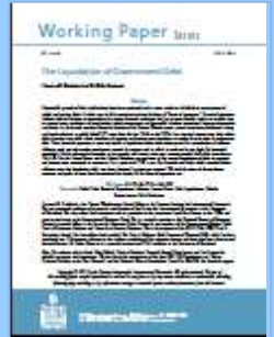
The Liquidation of Government Debt

http://www.iie.com/publications/wp/wp11-10.pdf