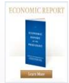
Economic Report of the President

http://www.whitehouse.gov/administration/eop/cea/economic-report-of-the-President