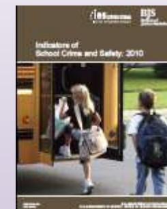
Indicators of School Crime and Safety 2010

http://www.america.gov/media/pdf/books/media-law-handbook.pdf#popup