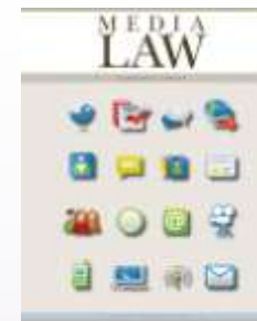
Media Law Handbook

http://www.cipamericas.org/archives/3895