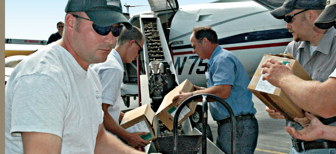
Aerial drops of ORV baits are the most cost-effective way to distribute vaccine in rural areas. Here, WS employees load baits onto a fixed-wing aircraft.