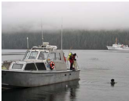
Dive operations are conducted from the launch

Length (LOA): 231 ft. Breadth: 42 ft. Draft: 15.5 ft. Hull: Welded steel/Ice strengthened Displacement: 1,800 tons Gross tonnage: 1,591 tons Cruising Speed: 12 knots Range: 6,000 nm Endurance: 22 days Hull Number: S 220 Call Letters: WTEB Commissioned Officers: 8 Licensed Engineers: 4 Crew: 23 Scientists: 23 Launched: March 1967 Delivered: January 1968 Commissioned: October 1968 Builder: Aerojet-General Shipyards, Jacksonville, Florida Designer: Maritime Administration