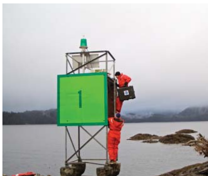
Field party checks a tide station