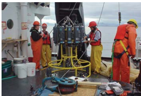
Scientists take water samples that were collected at different depths

Fairweather is equipped with precision echo sounders, data acquisition and processing computers, Differential Global Positioning System (DGPS) receivers, high speed and high resolution side scan sonars, bottom samplers, tide gauges and saltwater sound velocity profilers. Fairweather uses multibeam echo sounders and side scan sonars to map the ocean bottom, determine bottom characteristics and identify areas of interest to navigators, biologists and geologists. These units allow for 100% bottom search in project areas.