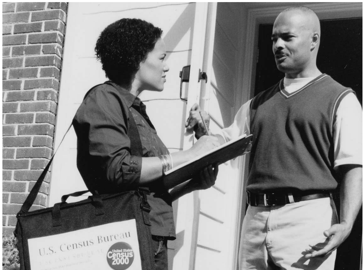
A Census Bureau field representative visits the household.

This cross-sectioning of the housing inventory gives a picture of houses and households as they change over long periods of time.