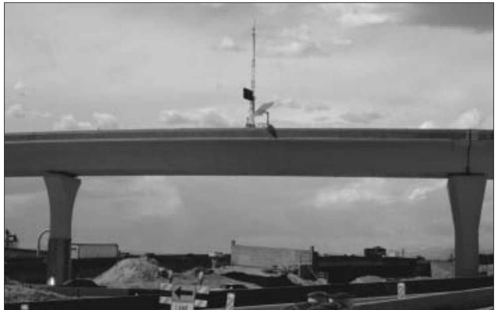
Figure 1 – Example of ITS equipment deployed at the Big I.

For the Big I project, NMSHTD employed ITS in the form of a mobile traffic monitoring and management system to help move the large number of vehicles through the extensive construction area. Mobile traffic monitoring and management systems use electronics and communications equipment to monitor traffic flow and provide delay and routing information to drivers and agency personnel. The ITS application deployed at the Big I in 2000 was used for the duration of the work zone (two years). The ITS components were deployed just prior to construction, with plans to incorporate portions of the system as part of a permanent ITS application for freeway management once construction was completed. Figure 1 shows some of the ITS equipment deployed at the Big I.