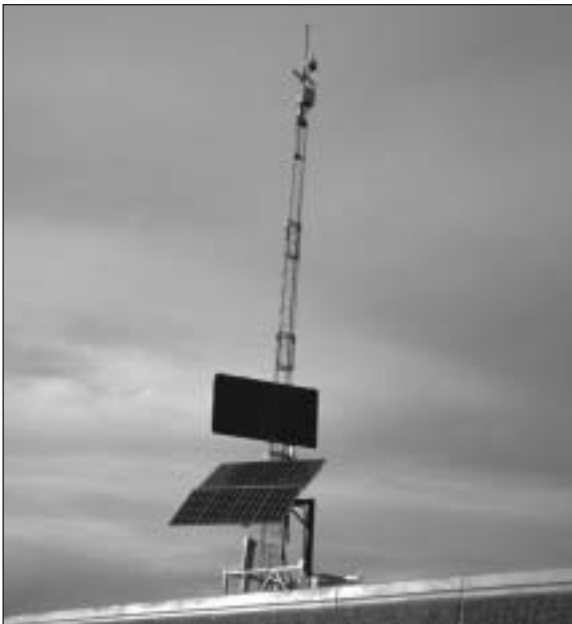
Figure 3 – Solar-Powered Sensors and Communication Equipment