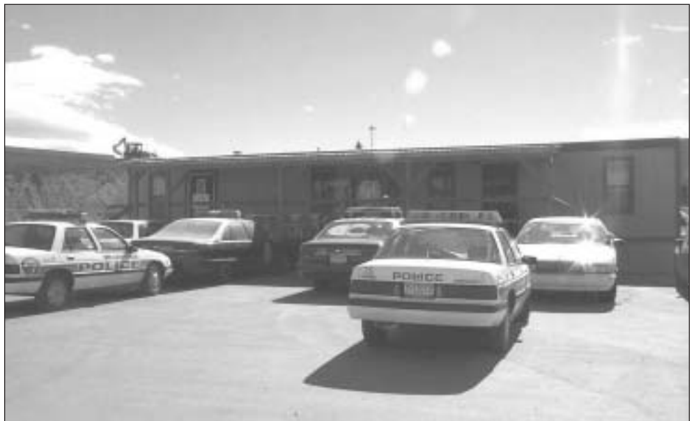
Figure 6 – The Big I Police Substation in the General Contractor's Staging Yard