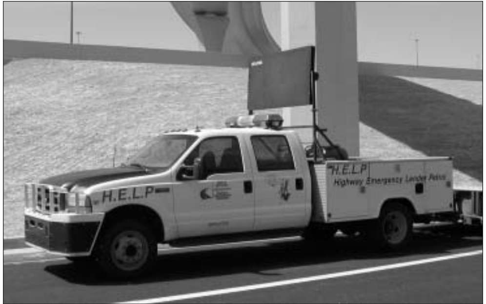
Figure 2 – Highway Emergency Lender Patrol Vehicle

Instituted prior to the Big I project, the Highway Emergency Lender Patrol (HELP) program consisted of two vehicles patrolling the Albuquerque Metropolitan area. NMSHTD recognized that the Big I project would require more HELP trucks. The Federal Highway Administration provided $250,000 toward the purchase of two additional HELP trucks. The additional vehicles were purchased through the construction contract to help patrol the Big I project area during construction. The original two HELP trucks were then able to patrol the rest of the Metro area.