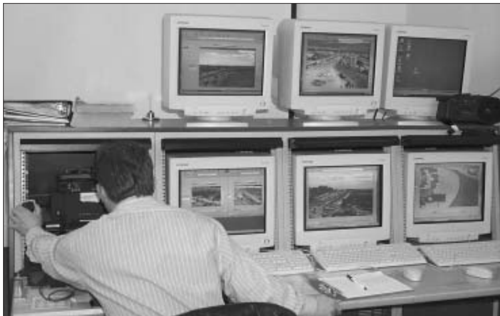
Figure 4 – The Big I TMC