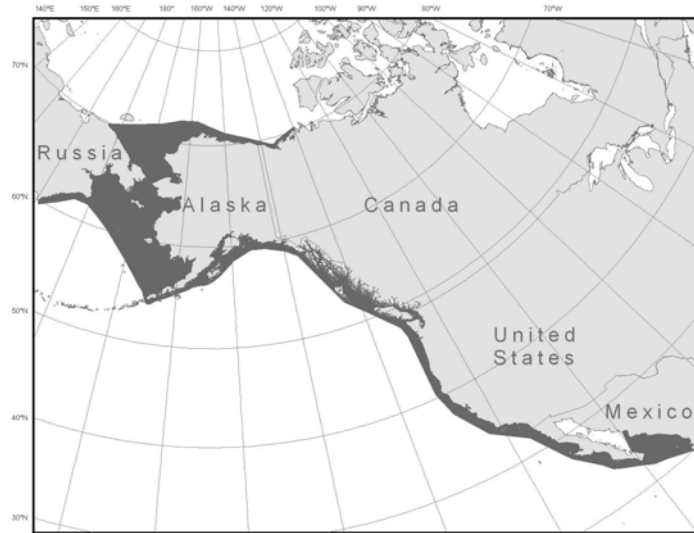
Figure 35. Approximate distribution of the Eastern North Pacific stock of gray whales (shaded area).

Gray whales formerly occurred in the North Atlantic Ocean (Fraser 1970, Mead and Mitchell 1984), but this species is currently found only in the North Pacific (Rice et al. 1984). The following information was considered in classifying stock structure of gray whales based on the phylogeographic approach of Dizon et al. (1992): 1) Distributional data: two isolated geographic distributions in the North Pacific Ocean; 2) Population response data: the eastern North Pacific population has increased, and no evident increase in the western North Pacific; 3) Phenotypic data: unknown; and 4) Genotypic data: unknown. Based on this limited information, two stocks have been recognized in the North Pacific: the Eastern North Pacific stock, which lives along the west coast of North America (Fig. 35), and the Western North Pacific or "Korean" stock, which lives along the coast of eastern Asia