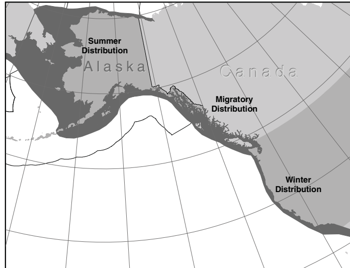
Figure 35. Approximate distribution of the Eastern North Pacific stock of gray whales (shaded area). Excluding some Mexican waters, the entire range of this stock is depicted.

Gray whales formerly occurred in the North Atlantic Ocean (Fraser 1970, Mead and Mitchell 1984), but this species is currently found only in the North Pacific (Rice et al. 1984). The following information was considered in classifying stock structure of gray whales based on the phylogeographic approach of Dizon et al. (1992): 1) Distributional data: two isolated geographic distributions in the North Pacific Ocean; 2) Population response data: the eastern North Pacific population has increased, and no evident increase in the western North Pacific; 3) Phenotypic data: unknown; and 4) Genotypic data: unknown. Based on this limited information, two stocks have been recognized in the North Pacific: the Eastern North Pacific stock, which lives along the west coast of North America (Fig. 35), and the Western North Pacific or "Korean" stock, which lives along the coast of eastern Asia (Rice 1981, Rice et al. 1984). Most of the Eastern North Pacific stock spends the