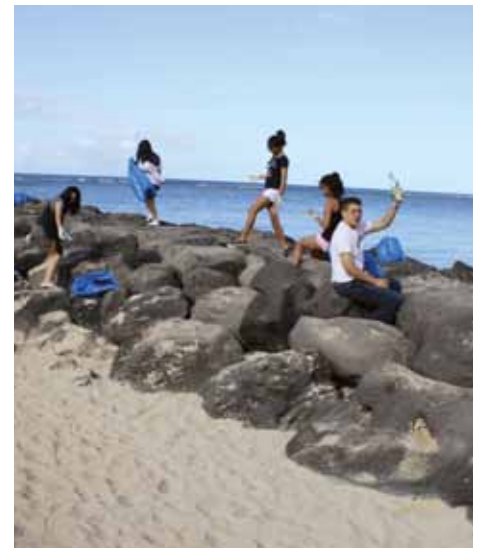
(Photo left and above) Approximately 15 student volunteers from the Punahou High School Junior ROTC program helped clean up the beach and berm area behind the Corps' Pacific Regional Visitor Center (RVC) at Fort DeRussy as part of Earth Day 2010 activities April 10.

Battery Randolph is listed on the National Register of Historic Sites and is one of 16 coastal fortifications built by the Corps between 1906 and 1917 for the protection of Honolulu and Pearl Harbors.