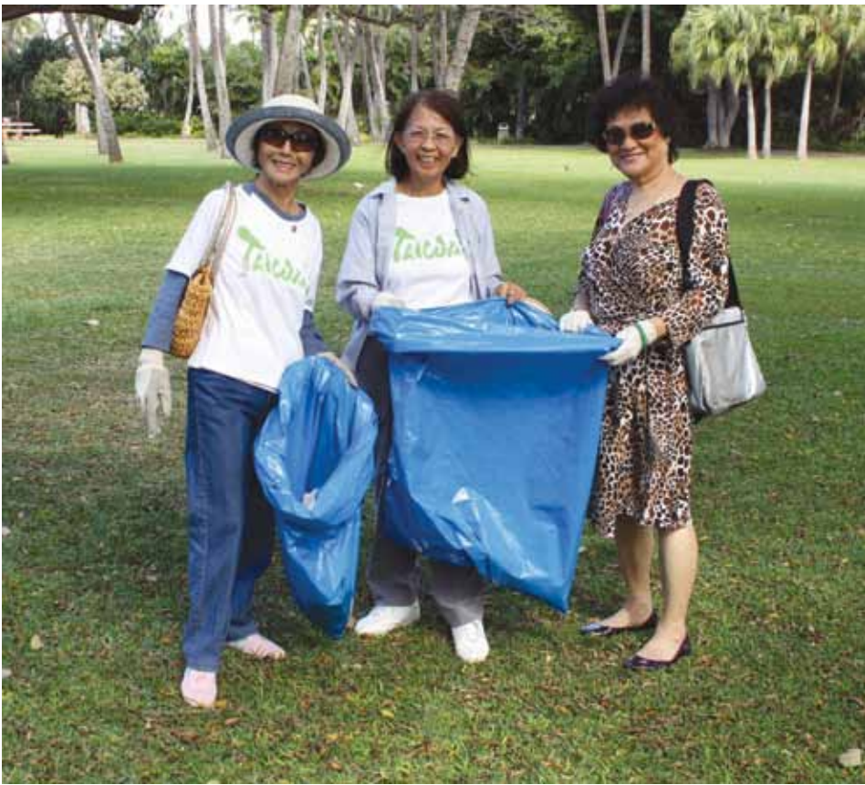
Ladies from the North America Taiwanese Association Hawaii Chapter clean up Fort DeRussy as part of the Corps and city and county of Honolulu's Earth Day 2010 Mauka to Makai Environmental Expo.