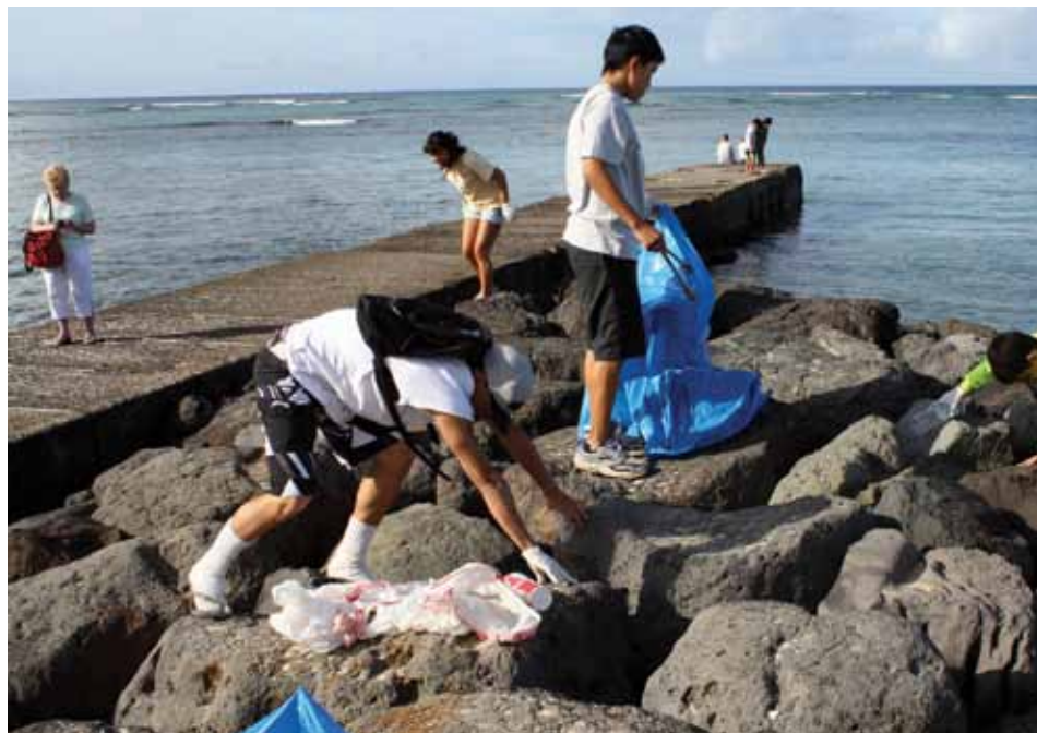
Cadets from the Punahou JROTC program clean up the Fort DeRussy berm as part of the Corps and city and county of Honolulu's Earth Day 2010 Mauka to Makai Environmental Expo.

"I always feel good when we can convey some of the messages about saving our plan-