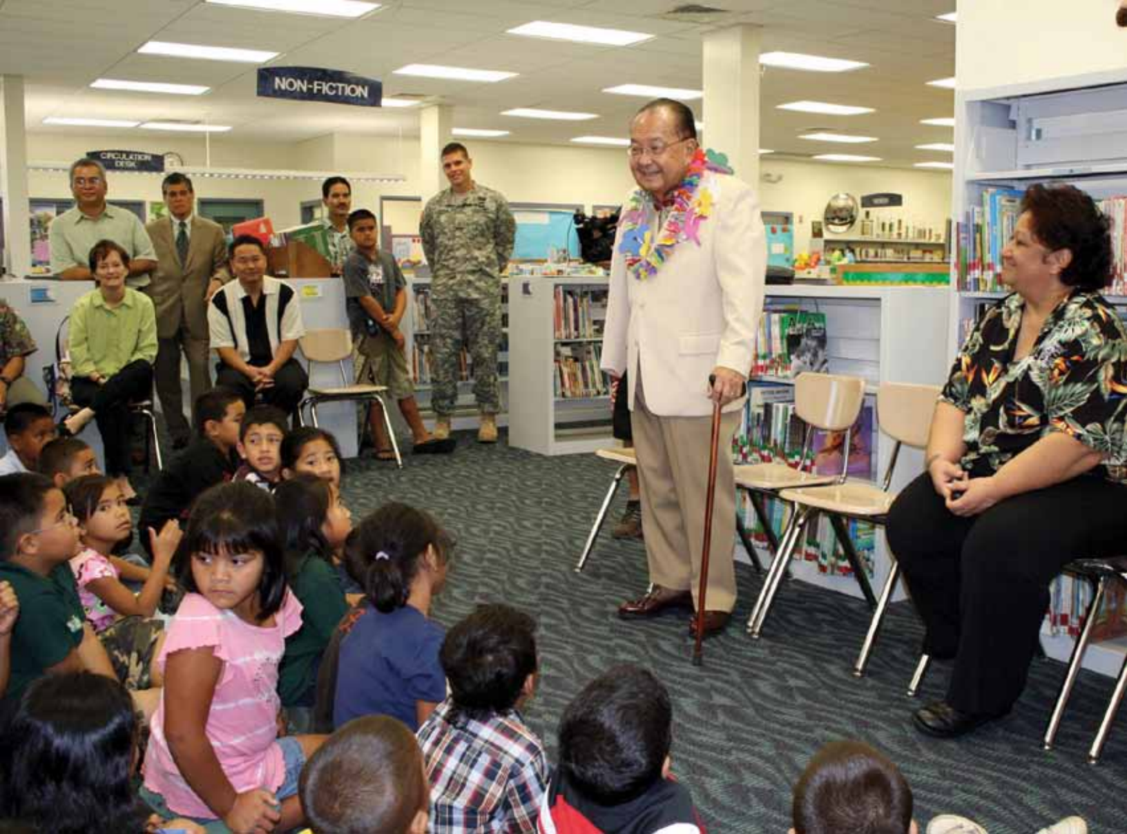
Sen. Daniel K. Inouye answers students' questions at Nanaikapono Elementary School in Nanakuli, Hawaii, as members of his staff, veterans, the state Dept. of Education and the U.S. Army Corps of Engineers look on. Sen. Inouye, other veterans and officials from the Army visited students on the Waianae Coast April 1, to see first-hand how they are using computers donated by the Army to increase their safety and knowledge about discarded munitions. The schools visited were Nanaikapono Elementary School and Ka Waihona Public Charter School in Nanakuli.

ing to be here and know that Hawaii is in good hands," Inouye said.