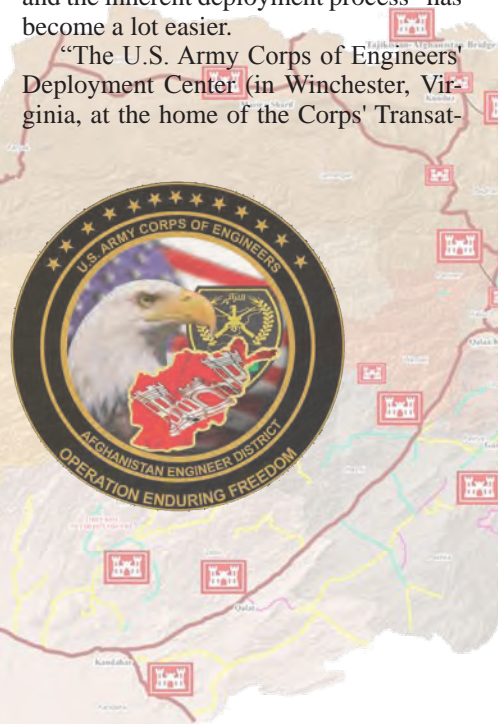
*Afghanistan Engineer District* Project Sites

"This is my third deployment. To have the opportunity to work in this environment, which is not your normal day to day life, is an experience you will never forget. You can spend six months or a year at home and not really have much of that time stick out in your memory, but you will never forget the time you spent overseas deployed for GWOT. The work is exciting, the people are interesting and you get to see different places."