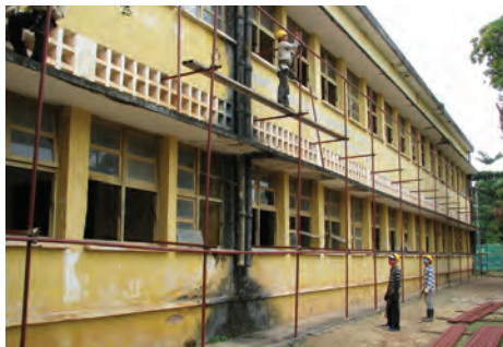
Workers assemble scaffolds at Kampot High School in Cambodia where an extensive renovation will replace and repair the concrete roof system and associated support structure.

cooperation and teamwork the projects could be accomplished.