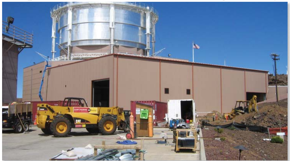
The Mirror Coating Facility (above) as it appeared in August 2007 during construction at the Maui Space Surveillance Complex. Ribbon-cutting ceremonies were held simultaneously last month in the new building and at the Institute for Astronomy, Pukalani, Maui.

The facility will also be used by the University of Hawaii Institute for Astronomy (IFA) to recoat their telescope mirrors; one of which is four meters in diameter and is capable of recoating