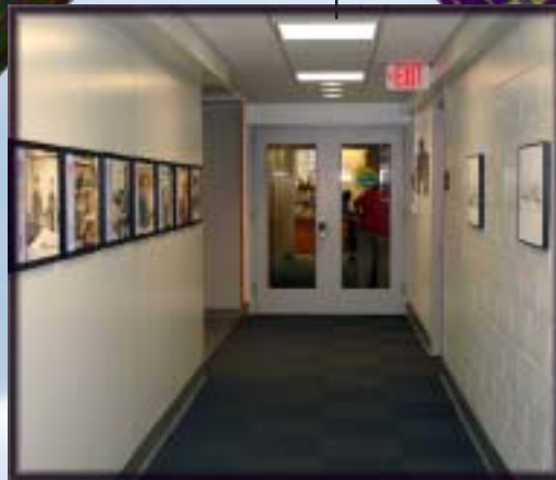
February 27 HED completes interior renovations of Fort Shafter building 230. (Above and background photo pages 8 and 9.)