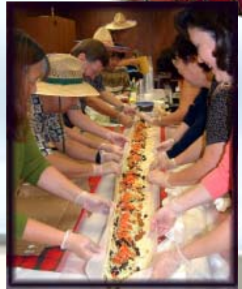
October 31 POD Team Burrito does it big at the Special Emphasis Program Committee Hispanic Heritage and Native-American Heritage event.

October 18 HED completes IFICS (In-Flight Interceptor Communications System) Radar Facility, Kwajalein. (Background photo pages 4 and 5.)