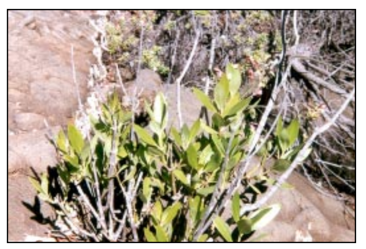
Close-up of endangered plant Hedyotis coriacea at PTA.

and bat surveys. The District also has contracts with non-profit organizations and universities such as The Nature Conservancy, Center for Ecological Management of Military Lands (Colorado State University) and the Research Corporation, University of Hawaii (RCUH) to perform flora and fauna surveys.