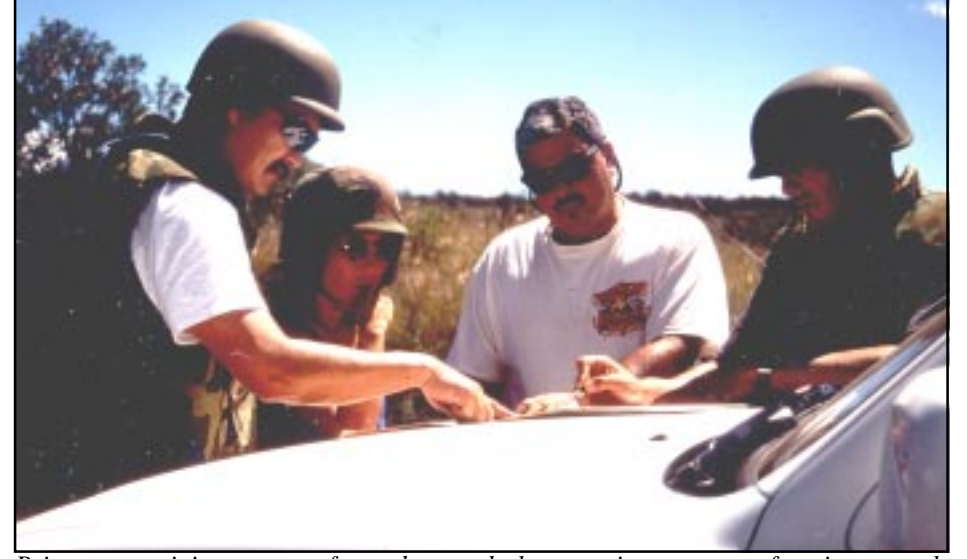
Prior to examining an area for endangered plant species, a team of environmental specialists uses a map to identify sector boundaries.

The 108.000acre installation is the U.S. Army Garrison, Hawaii's