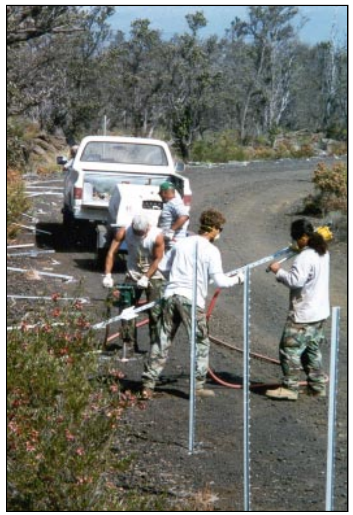
Fence crew installs barrier to protect endangered plants growing close to road within boundaries of Pohakuloa Training Area (PTA).

HED awarded contracts to companies such as Brewer Environmental Services for alien plant control, Donaldson Enterprises for surveys of unexploded ordnance to support natural resources activities and Rana Productions/Reggie David for endangered bird