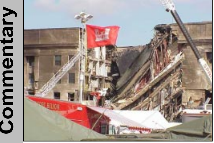
The Military District of Washington Engineer Co. from Fort Belvoir, Va. conducting urban search and rescue operations inside the Pentagon following the Sept. 11 terrorist attack.

The terrorist attacks against America have shaken us all. Nearly a week after the horrific events of September 11, I am personally unable to grasp the full scope of the destruction and loss of life. Several news commentators were quick to liken the attacks to "America's second Pearl Harbor." Perhaps our connection with the "first Pearl Harbor" makes the terrible events of September 11 so poignant.