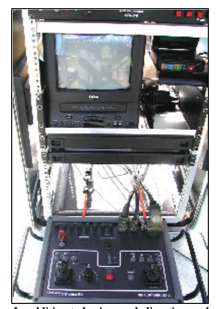
In addition to basic speed, direction and depth controls for the ROV (Remote Operation Vehicle), instrumentation also includes a television, a video cassette tape recorder and a digital recorder for collecting and recording Global Positioning location plots and visual information in both digital and VHS formats.

Marine Electronics Consultants (MECCO) representative Mike Chapman, designers of the system, said that this particular Phantom XTL ROV, number 430, was built by Deep Ocean Engineering, Inc. and is a unique machine built to be readily deployable and is designed for specific missions. The serial number identifies it as such, said Chapman. It was built to comply with HED specifications and meets airline size and weight requirements for both interisland and long-distance air travel. Each of its four components weighs in at less than 150 pounds and fits in shipping containers no larger than 67 inches long by 44 inches wide by 33 inches high. The cost of this ROV