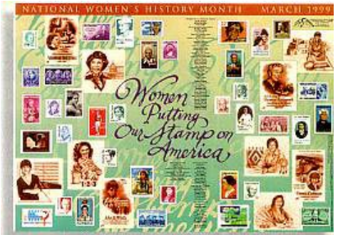
March is Women's History Month

"Would people say these things to my male competition?" she wondered aloud. But all in all, Lingle said, she enjoyed running for the Governor's seat very much, except for the losing part.