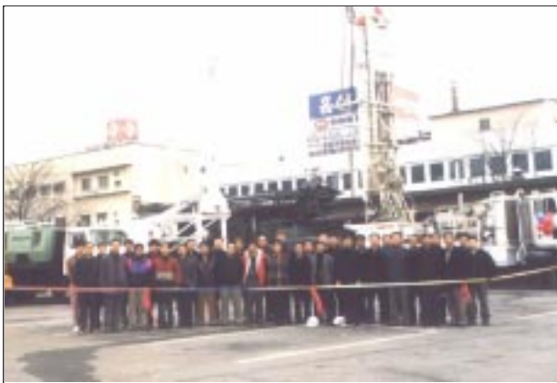
Anxiously waiting to have their picture taken, FED's foundation and well drilling teams are ready to put the new equipment into action.

Completion of the Drill Rig Shelter currently under construction at FED is scheduled for Spring, 1999.