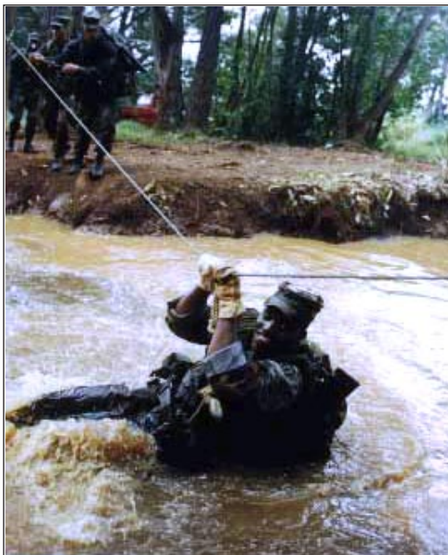
Neither rain nor mud nor the lack of a bridge will stop a soldier. The Army's purchase of the Kahuku Training Area site ensures its continued availability for training on the island of Oahu.

Purchasing may be cheaper, but not necessarily easier. There were some factors that complicated the transaction, said Stomber. One was that the property includes lands that are currently in use for electricity-generating windmills and other functions. In all, 107 easements were negotiated that affected nearly 400 acres. Another, is that the entire