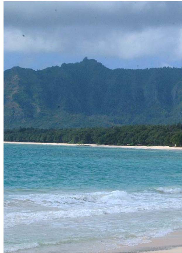
Bellows Air Force Station on the Windward side of Oahu