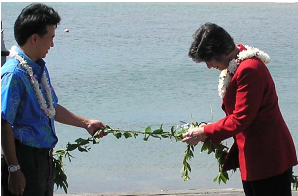
Hawaii State Sen. Shan S. Tsutsui, 4th Senatorial District (left), and Gov. Linda Lingle untie the maile lei to open the Kahului Small Boat Harbor to the public.

The $3.262 million project widened the entrance channel width to 50 feet and deepened it to 9.5 feet, dredging a 100-foot by 120-foot and 8.5-foot deep turning basin. In addition the project demolished the old 14-foot wide boat ramp and loading dock, constructed three, 15-foot wide launch ramps and a loading dock located at the man-made peninsula at the northwest corner of Kahului Harbor.