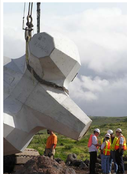
One of the largest Core-Loc units in the world (35-tons) is examined prior to placement at the Kaunalapau breakwater. Nearly 800 of the 35-ton units will be set in 80-90 feet of water. The Kaunalapau Harbor is the only commercial harbor on Lanai large enough to accommodate the barges which deliver almost all of the island's fuel and consumer goods.