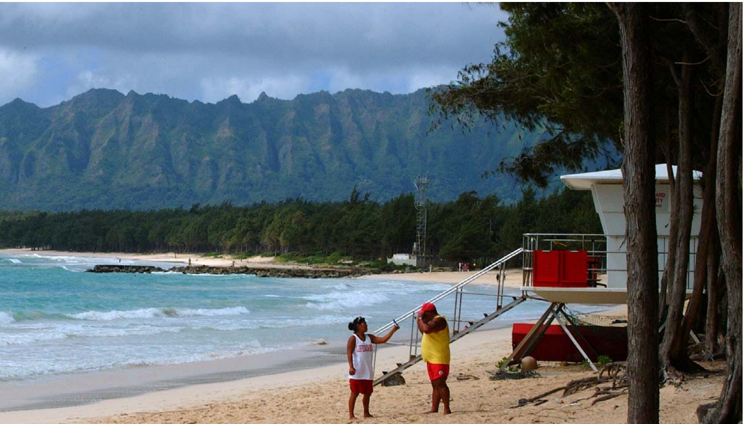
provided a picturesque backdrop for the District's annual event.