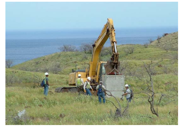
A crane carries an aluminum blast shield that is used around potentially unstable unexploded ordnance to protect area homes.

remove UXO. Due to project efficiencies, it is estimated that up to 450 acres may be cleared in this area.