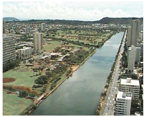
The Ala Wai Canal, a historical landmark in Waikiki, is plagued with a variety of modern day ailments which could affect its ability to prevent major flooding.

"The presence of alien algae is an indication of excess nutrients in the system and a signal that native algae is struggling to survive," Chow said. Efforts to remove the alien algae are an important step in restoring the Ala Wai's ecosystem. The Earth Day volunteers removed over six tons of it from Waikiki Beach.