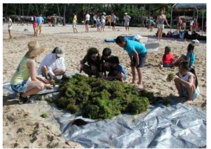
Earth Day volunteers removed over six tons of alien algae from Waikiki Beach. The algae comes from the Ala Wai Canal which flows into Waikiki. The foreign plants are just one of the many invaders which are upsetting the Ala Wai's ecosystem.

The alien algae blocks sunlight from shining through the water column, competes with the native algae and may not be a preferred food of the native marine life.