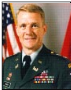
By Lt. Col. Ralph H. Graves HED Commander

Initiative: Improvisation is the essence of initiative in all combat just as initiative is the outward showing of the power of decision.—S.L.A. Marshall, U.S. general, 1900-1977