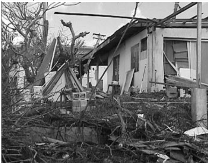
(Right) When a typhoon the size of Paka whirls by, wooden structures stand hardly a chance. Also hard hit were both wooden and concrete electrical power poles.