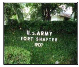
The main entrance of Fort Shafter reflects its history.

At one time, the lowlands were planted in taro, and the uplands are believed to have been heavily forested with sandalwood and trees suitable for the firewood much in demand by 19th century