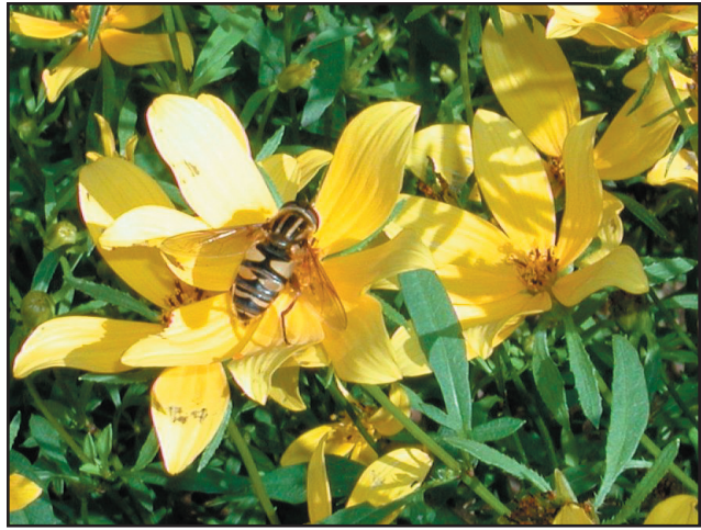
Charlie Rewa, NRCS

Flies and beetles are two important groups of native pollinators. Some flies resemble bees because they mimic bee coloration and patterns, allowing them to evade predation. Bees and flies both have transparent, membranous wings, but can be distinguished from one another because flies have two wings, while bees have four. Some pollinating beetles are quite small and difficult to see, resembling black specks on flowers, while others are large and colorful. There are hundreds of thousands of species of flies and beetles and many have yet to be identified. Habitat requirements vary from species to species. Flies and beetles require food, water, and cover in sufficient quality and quantity for each of their life stages (egg, larva, pupa, adult).