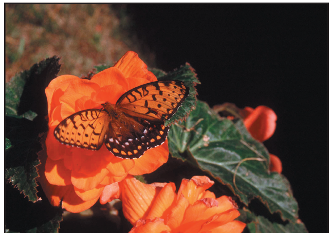
Butterflies are important pollinators of flowering plants.

After several weeks of eating and growing, caterpillars begin to transform into their adult forms. This transformation is called the pupa stage, and it is the non-feeding, stationary stage of a butterfly's life. Though they do not require food, pupae do need a protected site, such as a bush, tall grass, or a pile of leaves or sticks, on which to transform into their adult forms.