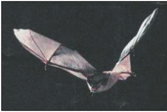
U.S. Fish and Wildlife Service

Many fruits rely on bats for pollination.