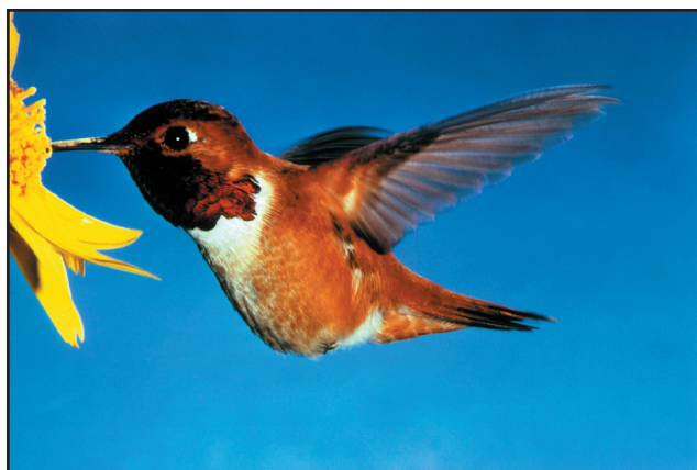
U.S. Fish and Wildlife Service

Hummingbirds are primarily woodland birds, occupying mixed woodlands, eastern deciduous forests, gardens, orchards, yards, overgrown pastures, citrus groves, scrub communities, hedgerows, and fence rows. They need trees, shrubs, and vines for shelter, shade, and nesting cover. Hummingbirds make their nests from downy plant fibers, such as thistle, dandelion, milkweed down, ferns, fireweed, young leaves, or moss, held together by spider silk and coated on