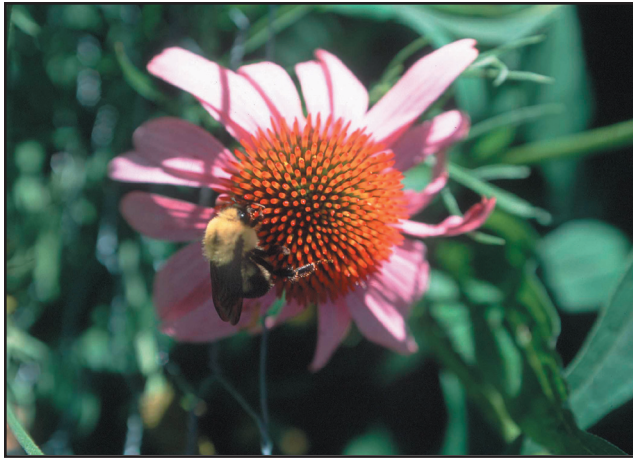
A bumblebee visits a purple coneflower.