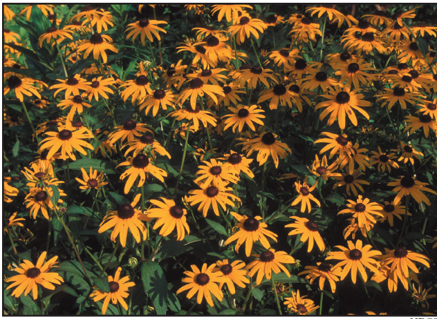
Clumps of flowers will attract more pollinators than individual plants. NRCS