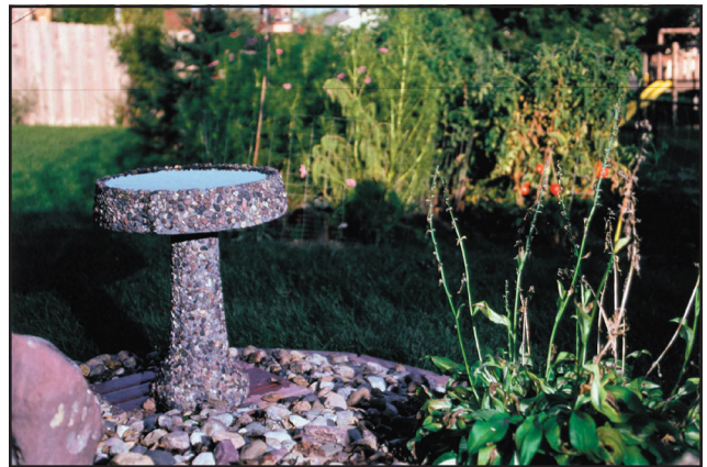
If natural sources of water are not available, birdbaths can provide water for many types of pollinators.

Pesticides, including herbicides and insecticides, do not discriminate between good species and bad species. An insecticide applied to eliminate a crop-eating insect may also kill valuable native pollinators. All groups of pollinators, as well as other wildlife, can be negatively affected or killed by pesticide use. Poisoning of pollinators may result from contaminated food (pollen and nectar), or directly from florets, leaves, soil, or other materials that may have come into contact with pesticides. Insecticide use should be reduced and herbicide use should be kept to a minimum to support the full range of native pollinators. Landowners should choose non-chemical or organic solutions to combat insect problems. If an insecticide is absolutely necessary, use the least toxic material possible, use it according to package directions, and treat plants at the time of day or period in the season when their flowers are not in bloom. Integrated Pest Management (IPM) is a critical component of safe habitat management for pollinators. For more information, see Fish and Wildlife Habitat Management