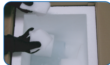
Freeze samples (optimally at -70° C or use dry ice).

For questions concerning this process, please contact: