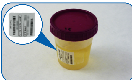
Place bar-coded label on all cups so that when upright, the barcode looks like a ladder.