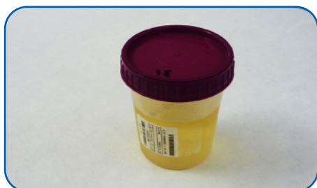
Label the urine cup with the appropriate bar-coded label, indicating the method of collection if other than "clean catch."