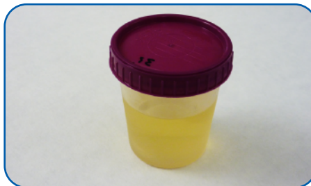
Collect 70 mL or more of urine in a screw- cap urine cup.