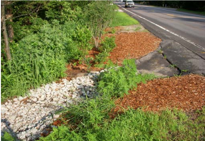
Curb-less roadside, equipped with stormwater drainage system in Cohasset, Mass.

stormwater collection system. The rain gardens were strategically placed within township right-of-ways and are designed to capture the first 0.9 inches of rain during wet weather events. A winner of the 2006 Massachusetts Smart Growth Award, the project provides an excellent example of how low-cost and low-maintenance green infrastructure techniques can improve stormwater quality and protect drinking water sources.