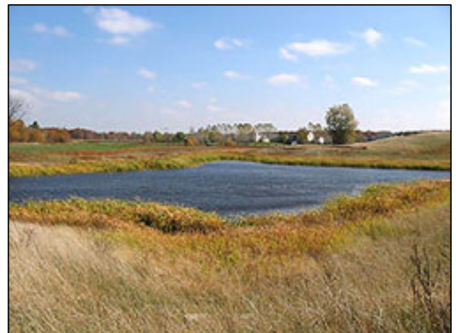
The valuable wildlife in the Winona Wetlands of Washington are protected with $400,000 loan.

stormwater attenuation for the area and maintains valuable habitat for local wildlife. Potential development of the area not only threatened the wetlands, but would also result in significant stormwater management problems. The city purchased the 6.5 acres in Phase I of the project and an additional 9 acres in Phase II. The loans were completely paid back within 5 years with a portion of the city's new $5 per household stormwater utility fee.