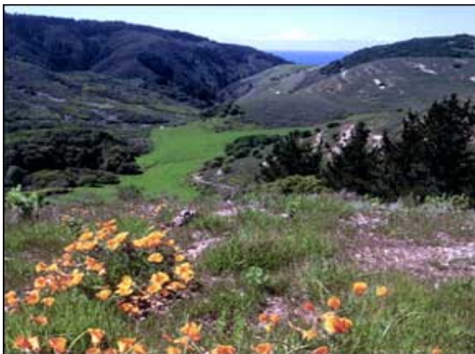
Easement in Monterey Co., CA protects aquatic resources.

to fund the interim financing and holding of a critical portion of land, known as the Palo Corona Ranch, in Monterey Country. The Palo Corona Ranch is largely considered the gateway to California's Big Sure coastline. This project protected 9,898 acres of pristine Redwood and Monterey Pine forests from imminent development. Without the Nature Conservancy's purchase increased sedimentation and stormwater runoff would have caused severe impairment to coastal and aquatic resources. The property will be retained by the Department of Parks and the Monterey Peninsula Recreational Park District with dedicated funds over a seven year period.