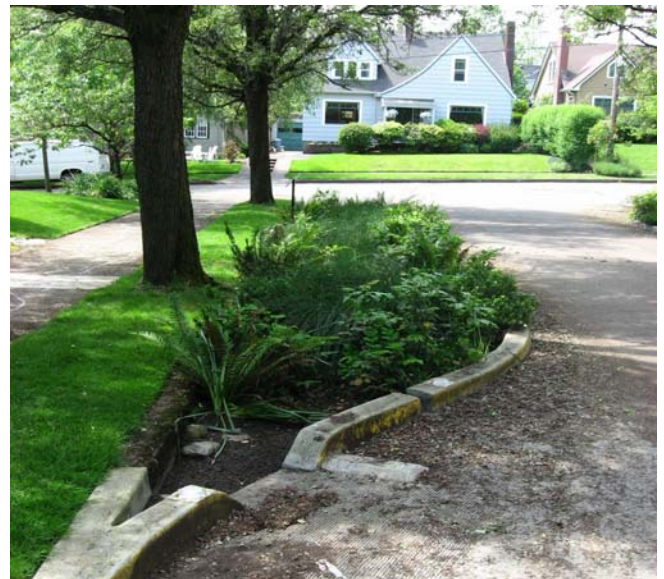
Vegetated swales capture and infiltrate runoff along this "green street" in Portland, Oregon.

These benefits make green stormwater development an attractive option for towns and cities looking to upgrade their infrastructure systems. Nevertheless, many local governments lack the financial resources needed to implement green infrastructure projects in their communities. This is where the CWSRF can help.