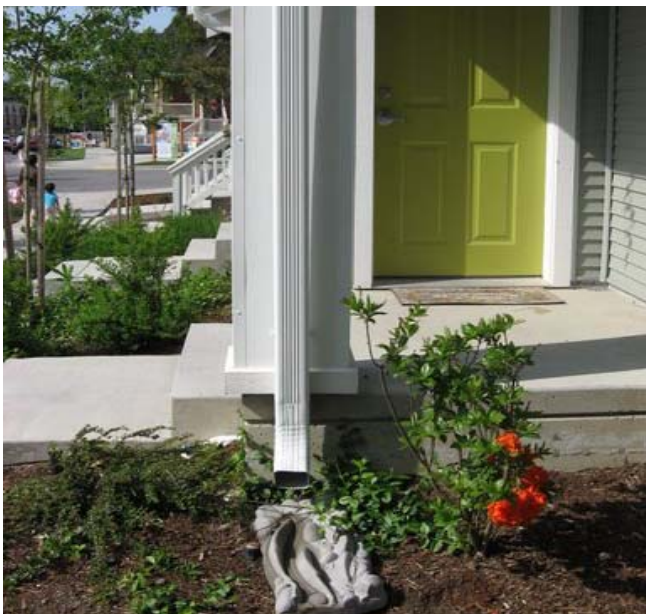
Downspouts that are not connected to the sewer system allow stormwater to be absorbed into landscaped areas.

The CWSRF is a powerful financing program that provides loan assistance for wastewater treatment, stormwater management, nonpoint source abatement and estuary protection projects. Today, all 50 states plus Puerto Rico operate successful CWSRF programs that have provided over $68 billion in financial assistance since 1988. This funding is provided in the form of low interest loans at an average of 30% below market rate. In 2007 alone, the CWSRF financed $5.3 billion in national water quality projects. At present, only a small percentage of the CWSRF has financed green infrastructure. However, as demand for green infrastructure projects increase, we expect CWSRF funding to be used more.