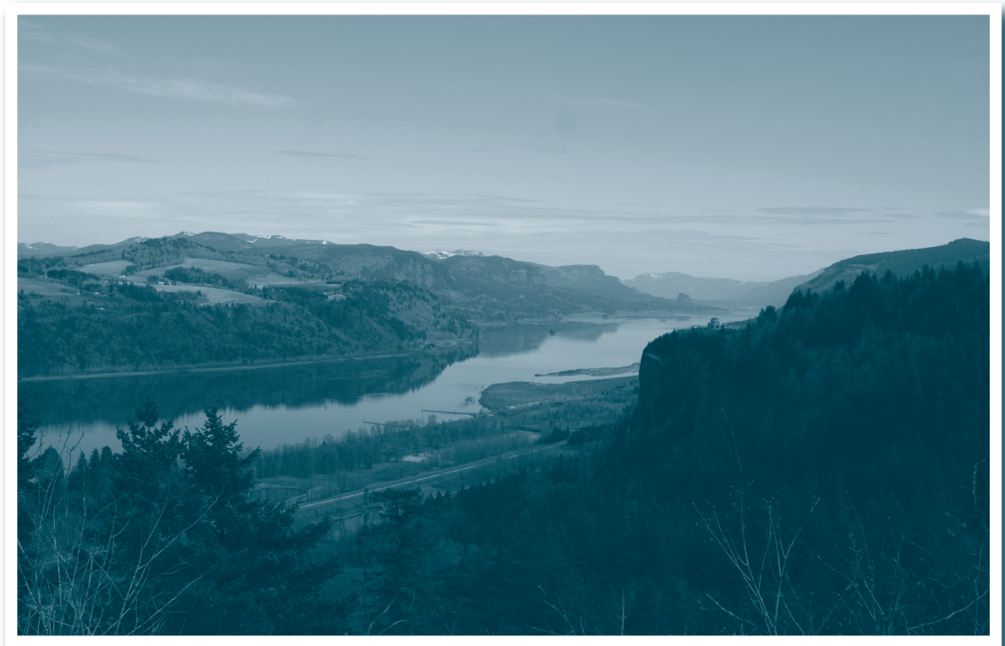
The Columbia River is part of the Lower Columbia River National Estuary.