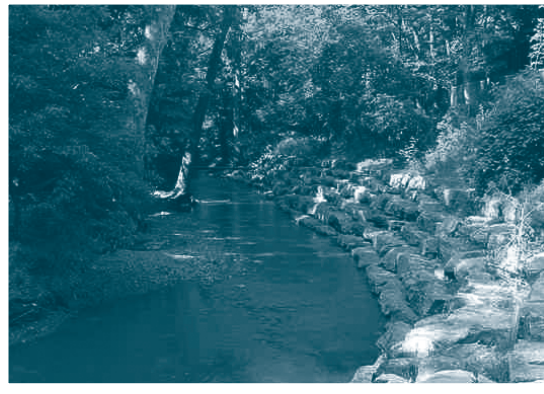
Watts Branch in Rockville, MD. The restoration of Watts Branch was funded with CWSRF dollars.

Rockville, MD received a CWSRF loan to fund the planning, design, and restoration of a stream, which included the stabilization of eroding stream banks and enhancement of existing wetlands.