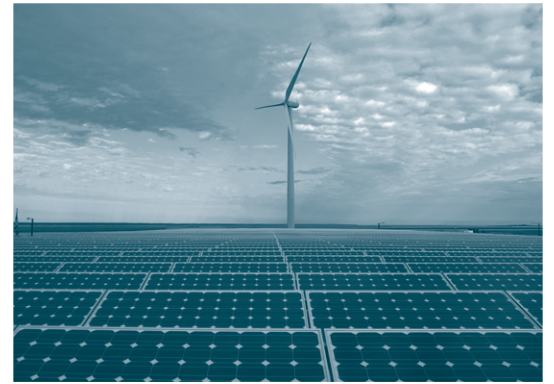
The Atlantic County Utilities Authority used CWSRF funds to install solar panels at its wastewater treatment facility.

Atlantic County, NJ used a CWSRF loan to install 2,700 solar panels at five locations across a wastewater treatment facility and now has a projected energy cost savings of $115,000 per year.