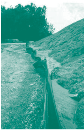
Sediment accumulation at a construction site.

Runoff from agricultural sources is often the result of improper management of manure and animal wastewater as well as pesticides and fertilizers used on crop land. When left uncontrolled, these discharges can result in fish kills, the destruction of spawning and