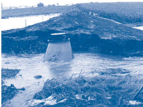
Storm sewer overflow following a precipitation event.

Because there are many sources of wet weather discharges, there are also many types of projects related to such discharges that may be funded by the CWSRF, falling under different eligibilities. Combined sewer overflow and sanitary sewer overflow correction projects may be funded under the CWSRF's §212 point source eligibility. CSOs and SSOs are defined by the CWA as treatment works and therefore must be publicly owned to be eligible.