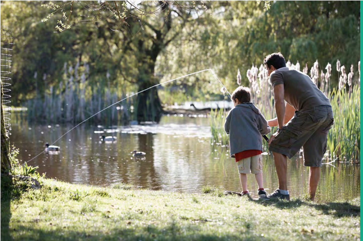
WRP wetlands can offer their landowners a variety of recreational opportunities.