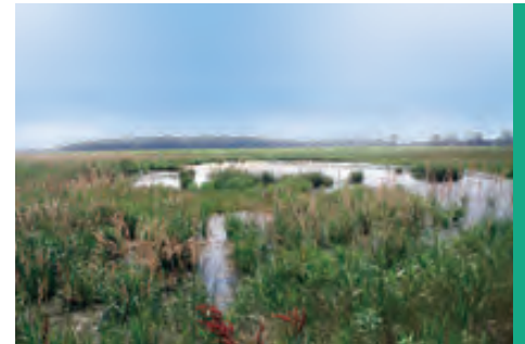
Potawatomi Tribe WRP project.