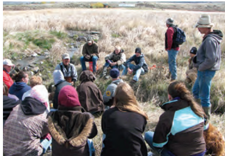
Outdoor classroom in Montana's Silver Springs WRP.