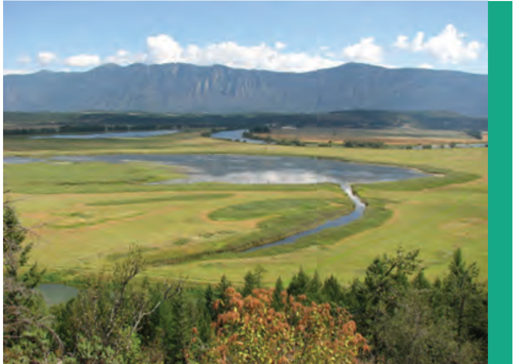
The Boundary Creek WRP in northern Idaho provides habitat for the white sturgeon, caribou and grizzly bear.

The key to WRP's success is its involvement and enthusiasm from private landowners and NRCS conservation partners. Landowners across the country have watched wetland habitat positively transform their land and, their community. There are thousands of acres still on the enrollment waiting list. WRP has proven to be a program where NRCS, landowners and many various partners can work together to achieve truly cooperative conservation resulting in long-term benefits on a landscape scale that will ensure our wetland resources are available for future generations.