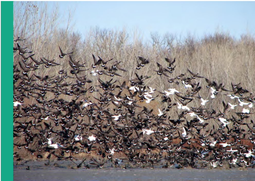
Waterfowl rise up out of a WRP project in south central Kansas.

Over the last 20 years, WRP has catalyzed true landscape-scale conservation. Individual WRP easements, which can range from two to 26,000 acres, are often adjacent to other WRP easements, or protected areas such as refuges and parks. The linking of these projects has resulted in the creation of significant wetland and wildlife corridors.