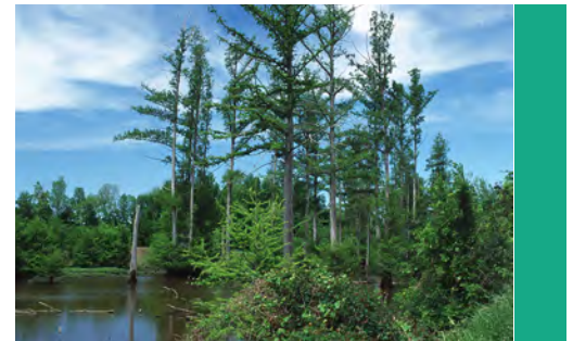
Remnant of a cypress/tupelo wetland in central Mississippi as part of a WRP easement.