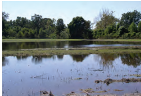
A 211-acre WRP easement in the Mississippi River Drainage area of western Kentucky is only a half-mile from the Reelfoot National Wildlife Refuge.