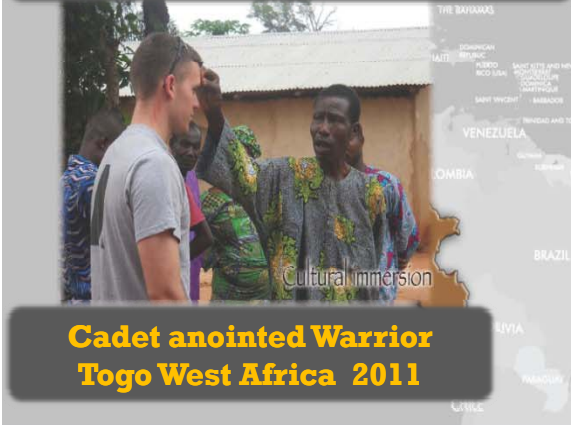
Cadet anointed Warrior Togo West Africa 2011