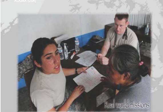
Cadet Medical Interpreter Hospital Ship COMFORT 2011

It's all part of the Army ROTC college experience.