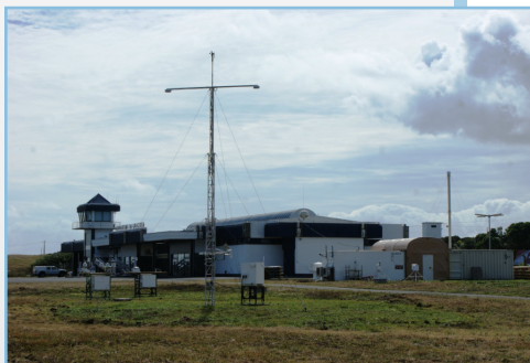
Graciosa Island, Azores (2009-2010)