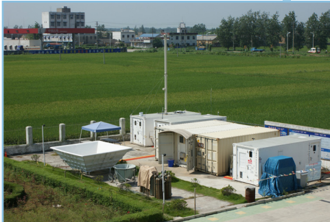
Shouxian, China (2008)