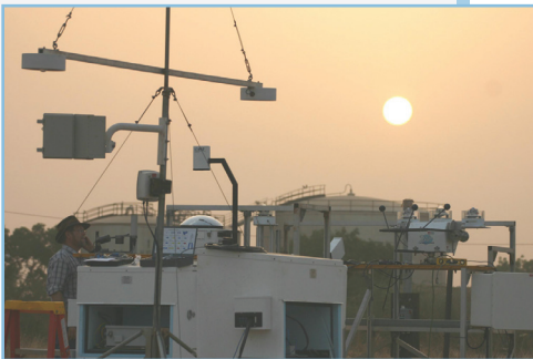
Niamey, Niger (2006)

Because of its flexibility and portability, the AMF is an ideal platform for conducting collaborative research anywhere in the world. Scientific and infrastructure staff are available for collaborative planning activities, and systems are available to provide local on-site or virtual support for collaborating scientists using the AMF for their research.