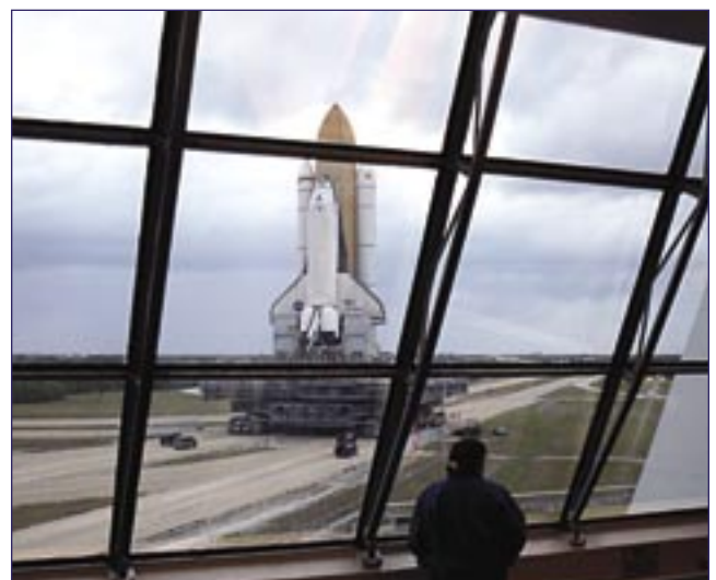
A view from inside the Launch Control Center as Columbia rolls out to Launch Complex 39-A on December 9, 2002.

These recommendations reflect both the Board's strong support for return to flight at the earliest date consistent with the overriding objective of safety, and the Board's conviction that operation of the Space Shuttle, and all human spaceflight, is a developmental activity with high inherent risks.