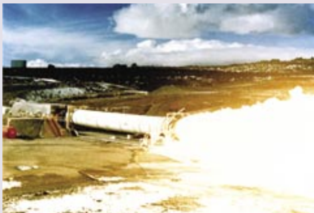
A Solid Rocket Booster (SRB) Demonstration Motor being tested near Brigham City, Utah.

Despite their power, the Space Shuttle Main Engines alone are not sufficient to boost the vehicle to orbit – in fact, they provide only 15 percent of the necessary thrust. Two Solid Rocket Boosters attached to the External Tank generate the remaining 85 percent. Together, these two 149-foot long motors produce over six million pounds of thrust. The largest solid propellant rockets ever flown, these motors use an aluminum powder fuel and ammonium perchlorate oxidizer in a binder that has the feel and consistency of a pencil eraser.