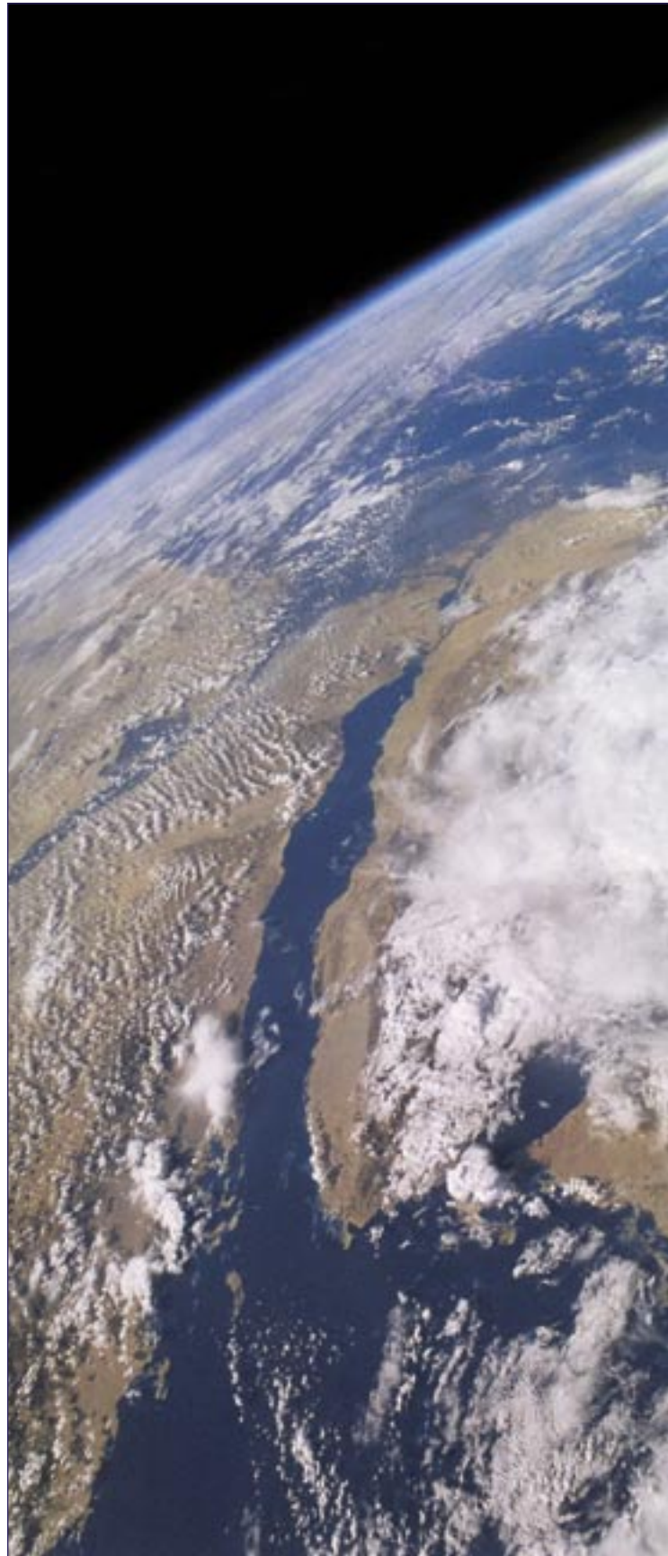
This Earth view of the Sinai Peninsula, Red Sea, Egypt, Nile River, and the Mediterranean was taken from Columbia during STS-107.

Part Four of the report by the Columbia Accident Investigation Board contains material relevant to this volume organized in appendices. Additional, stand-alone volumes will contain more reference, background, and analysis materials.