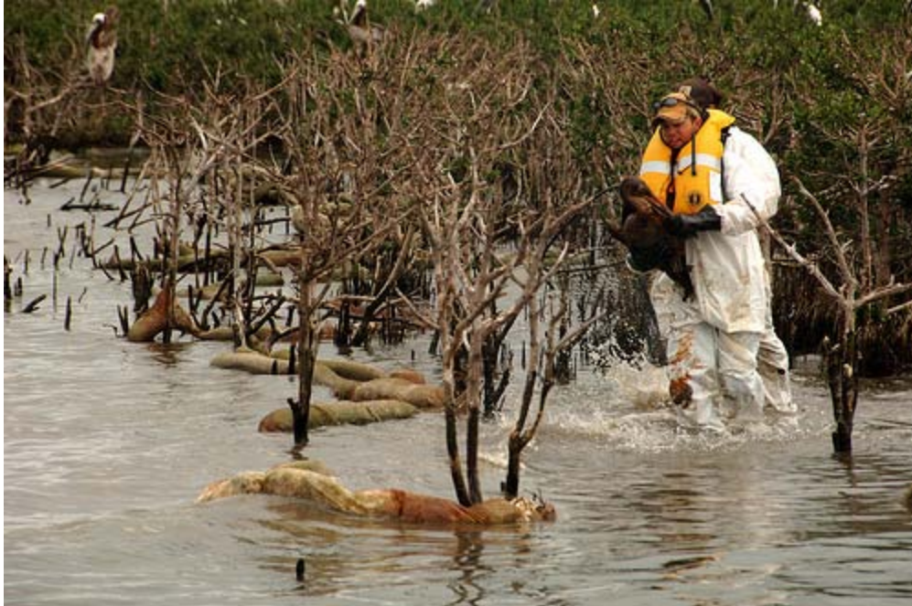
Deepwater Horizon Response Bird Rescue.