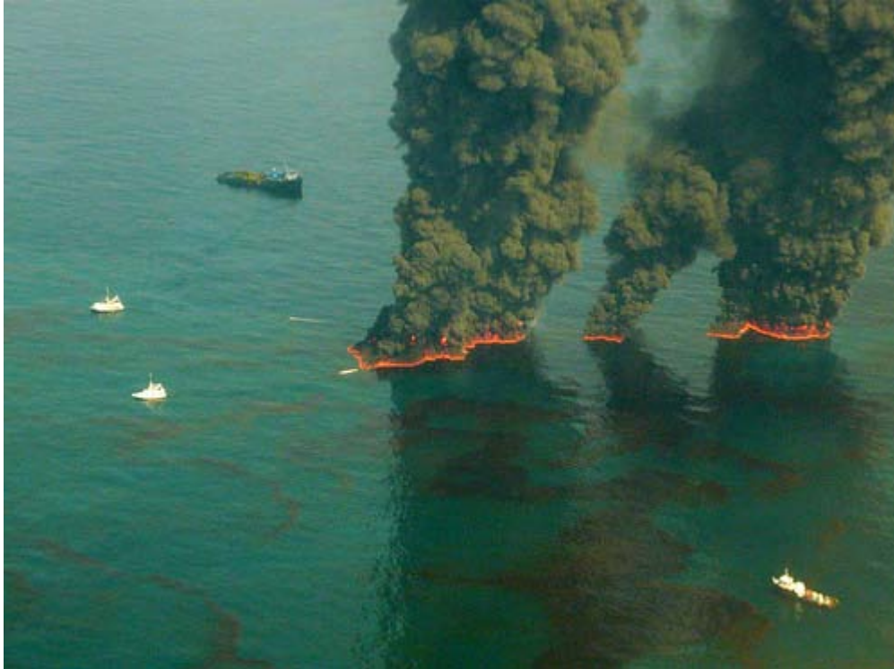
Aerial view of oil being burned from the Deepwater Horizon/BP incident, May 19, 2010.