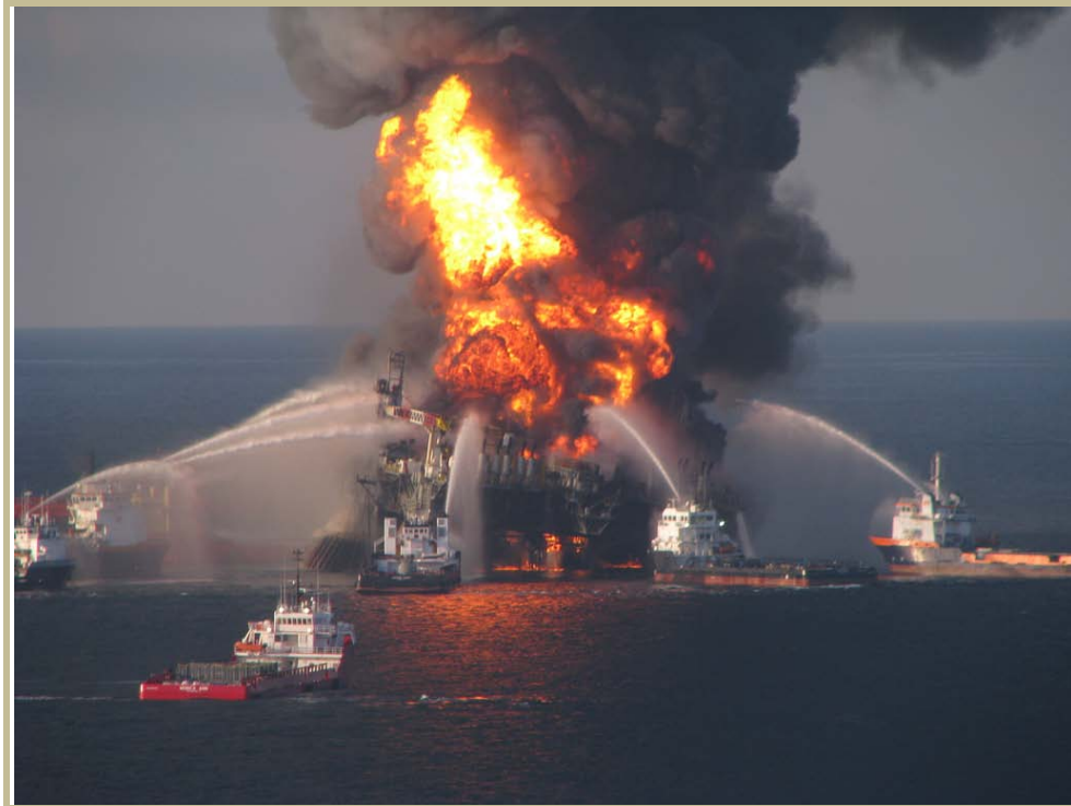
Gulf of Mexico – Deepwater Horizon fire.